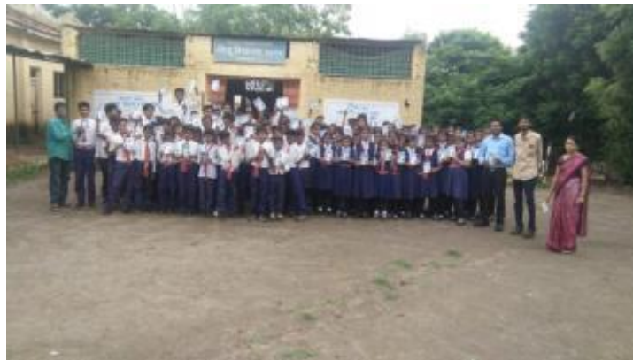
Students and teachers of Narendra High School Telgaon after book distribution