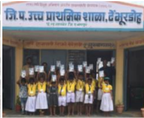
Students of Lokmanya High School, Badegaon (left) and ZP Primary School, Temburdoh (right) receiving bird guide books