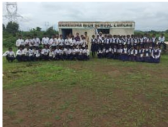
Bird guide book distribution in ZP Upper Primary school (left) and Narendra High School (right) in Lohgad