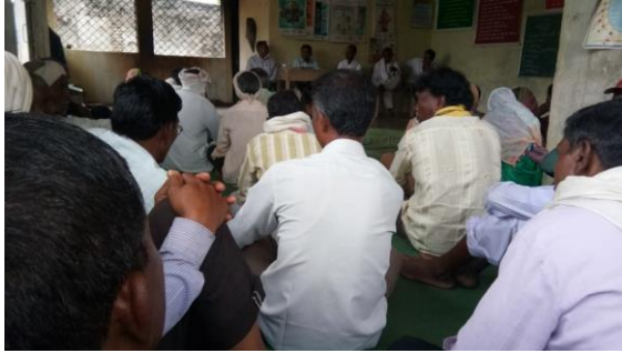
Meeting with villagers at Balapur