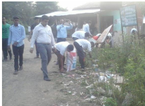
Anti plastic programme at Mangezari