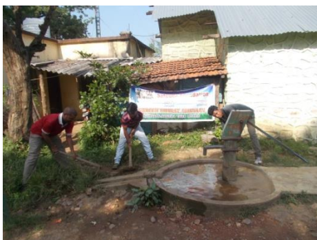
Volunteers clean area around hand pump at Mangezari.

Water had spilled over while people drew from the hand pumps and had stagnated, leading to proliferation of mosquitoes and insects. Our teams cleared the area, removing scum and organic growth and dug canals to drain away the water.