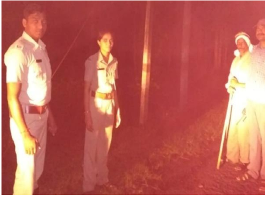
Night patrol on road from Mangezari to Govindtola.