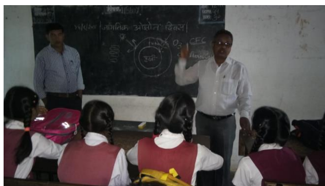
Environment education programme at G.E.S Girls' High School, Kurhadi