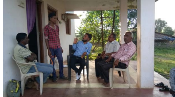
Awareness programme for unemployed youths at Kodebarra