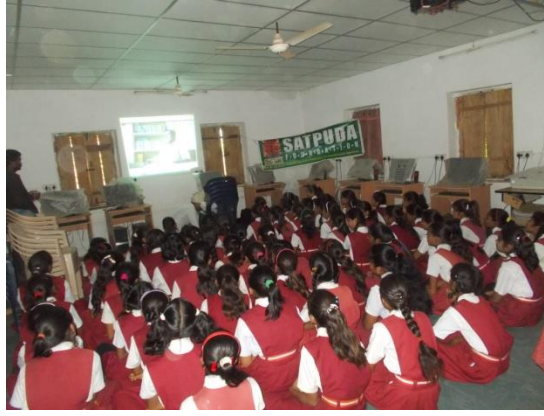
Film show at Wadegaon School.