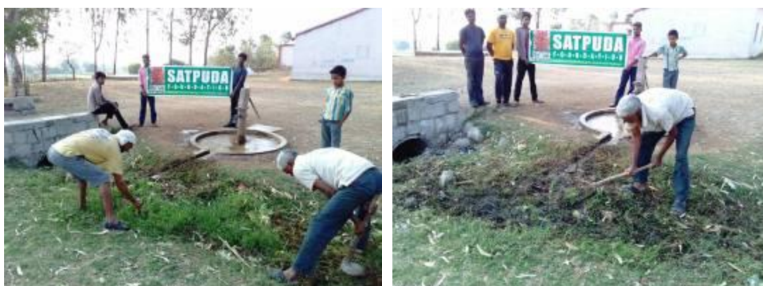
Bisenpur - Area next to hand pump before (left) and after our programme (right)

A similar programme was organised on February 20 to clear the area next to a hand pump at Bisenpur