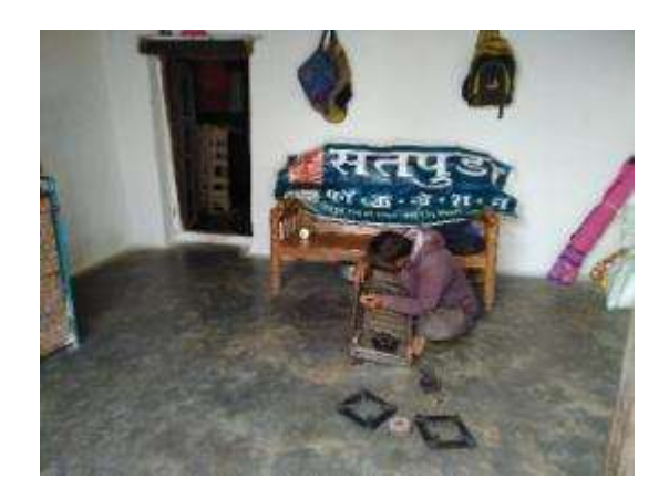
Amajhiri – Niranjan undertaking repair of a biogas stove

Biogas is a sustainable form of energy which is used mainly for cooking purpose, reducing the need for fuel wood and thereby reducing pressure on forests. Biogas is produced from a slurry of cow dung through anaerobic decomposition. Satpuda Foundation has been undertaking repair activities of these biogas production units and stoves. During January, Niranjan repaired a faulty unit at Aamajhiri village.