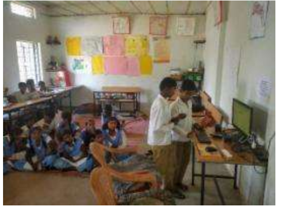
Students handle computers during computer awareness session at Potiya (left) and at Kohoka (right)

High School Certificate examination is an important examination for school students. With the state level examination due to be held next month, our team visited Turiya High School and held a session on motivating students for the upcoming examination and also discussed various techniques to boost performance in the final exam.