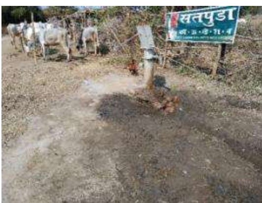
Khamba— Cleaning of area next to hand pump underway (left); after completion (right)

On January 28, Kamlesh assembled a group of volunteers at Chirrewani to construct a soak pit. Kamlesh had explained the concept of groundwater recharge and how soak pit construction can help in faster percolation of waste water and reduce the spread of water borne insect vectors.