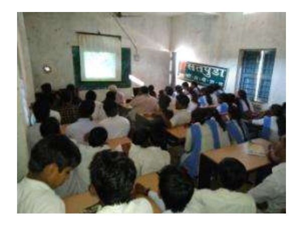
Primary schol students watching a wildife documentary at Potiya (left) and Turiya (right)

Satpuda Foundation has been conducting IT education program for students free of cost since the year 2013. Basic computer skills are taught to the students to make them feel comfortable with technology and improve their IT skills. During January, computer awareness and hands-on practice sessions were held in Potiya Middle School and Kohoka Middle School on 21<sup>st</sup> January and 22<sup>nd</sup> January respectively which were attended by a total of 51 students.