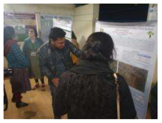
Open well and groundwater data on a GIS Map (left); Poster presentation at CILS (right)