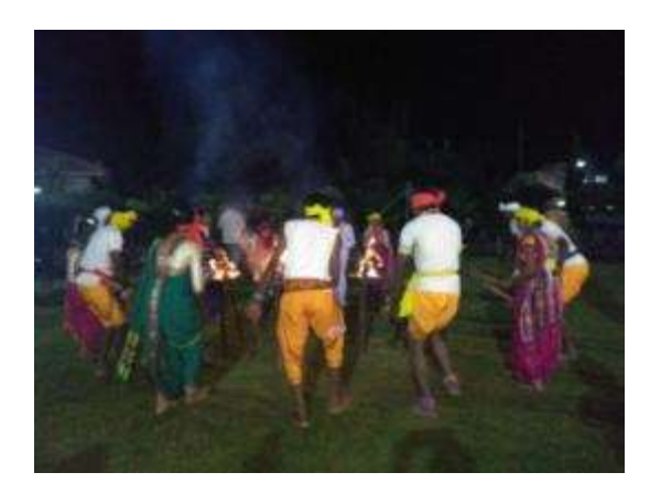
Awarghani- Tribal dance program at Olive Resort

Satpuda Foundation has been working with tribals for their empowerment and exploring new employment opportunities for them. Since 2008, the Foundation has been associated with Tribal Dance group of Sawara village in Maharashtra, motivating them and supporting them to perform at local resorts. During the month of January, two such performances were organised.