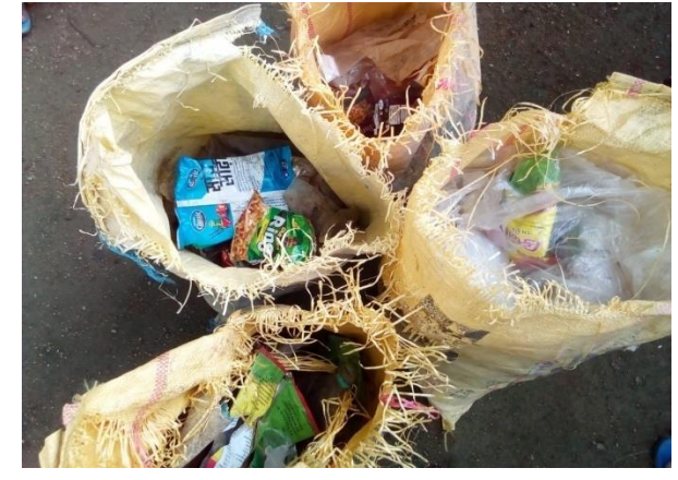
Khutwanda- Anti-plastic drive during garbage management programme

We also organized plantation drives with villagers. A total of 270 saplings of different species were planted during the drives.