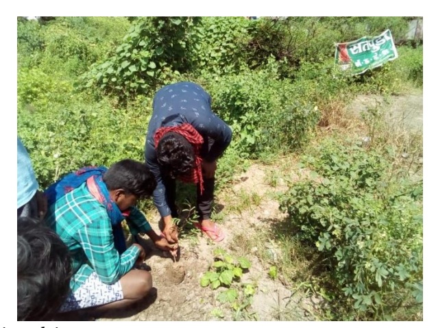
Kondegaon-Village youths participate in plantation drive

We have formed groups of local village youths who have been supporting Satpuda Foundation and Forest Department in nature and conservation activities. During August, we organized joint foot patrols with them at Khutwanda and Mudholi along with Forest Guards. Following recent tiger mortality case, we patrolled the beats adjoining farmlands. Patrolling teams also noted water levels of water bodies, hoof and pug marks, presence of birds etc. The youths were also taught about floral indicators of bio-diverse forest.