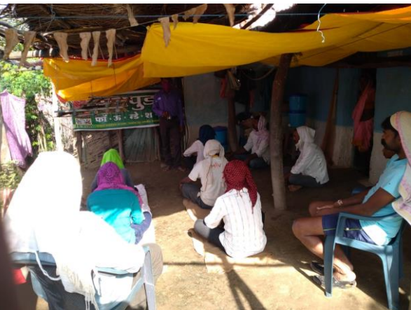
(Left) Adegaon- Meeting with cattle owners about livestock management (Right) Khutwanda- meeting with PRT and VEDC members about preventing electrocution of wild animals