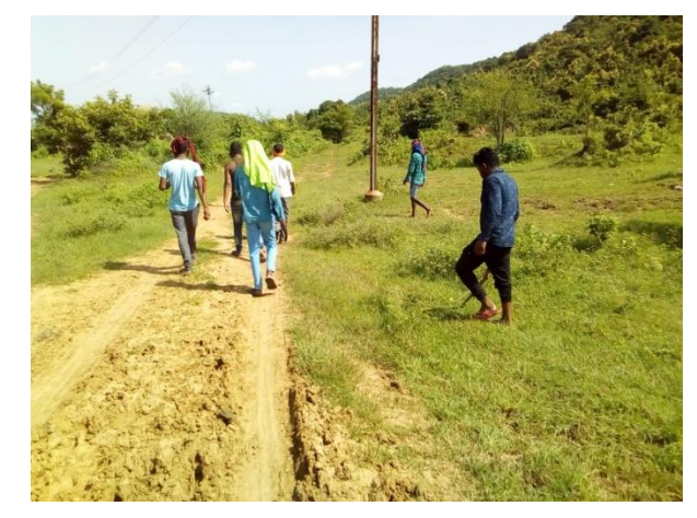
Khutwanda- Youths patrol an area prone to poaching