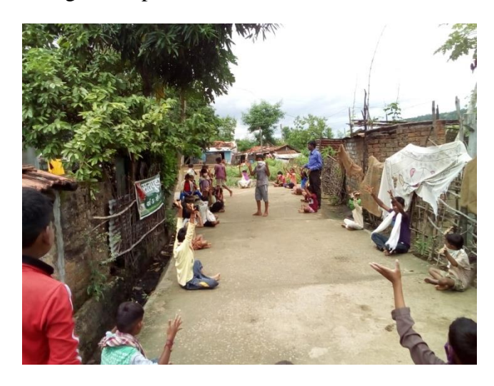
Bhamdeli- Children participate in an interactive nature game

During the month of August, we organized wildlife conservation awareness and environmenteducation p rogrammes in Mudholi and Bhamdeli villages. We engaged children in interactive nature games through which they learned to identify wild animals and the importance of their conservation. A total of 44 local children participated in these activities. Nature and bird watching trails will be organized post-monsoon.