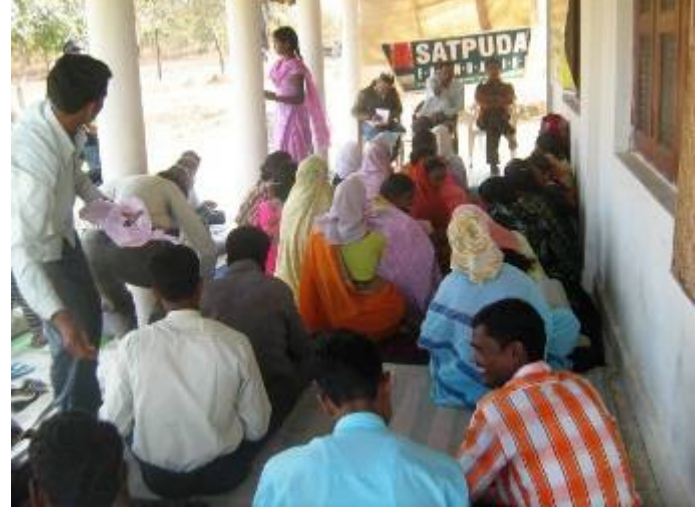
Capacity-building workshop for SHGs at Chapri, Kanha