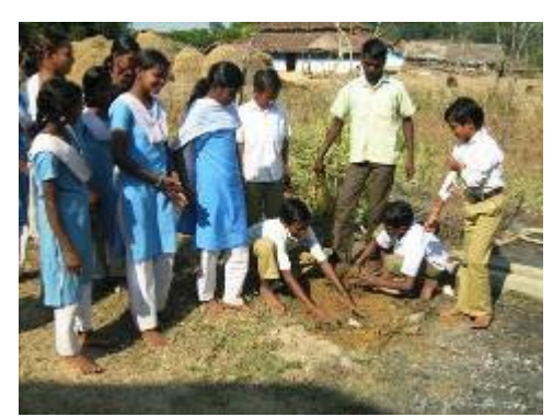
Compost pit being dug at Govt Middle School, Patpara