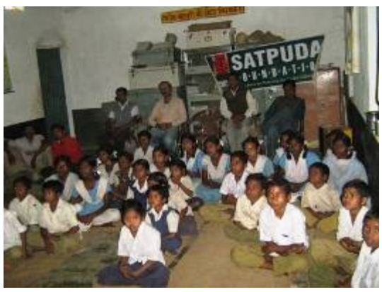
Wildlife film show at Middle School, Patpara