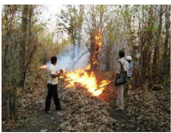
Amit Awasthi helps in fighting fire at Batwar Ghat