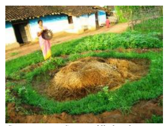
Compost pit at Sautiya filled with organic waste