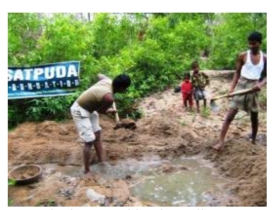
Water body created by shramdhaan