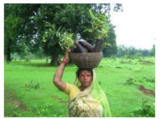
Chapri villager with her allotment of saplings Father and child plant sapling at Chapri