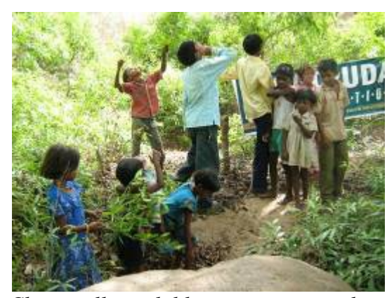
Chapri village children on nature trail