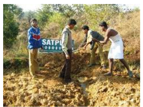
Work in progress to build stop dam at Budbudi Nallah, near Chapri