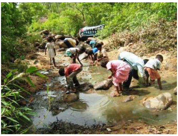
Cleaning up waterhole at Chapri