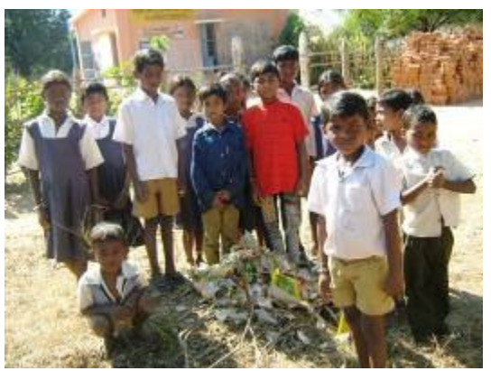
Plastic litter collected by students of Government Middle School, Batwar