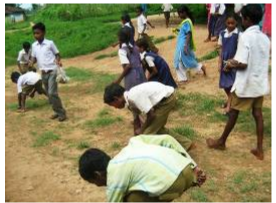
Anti-plastic campaign at Government Primary School, Manegaon