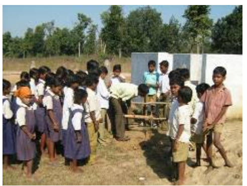
Compost pit being dug at Govt Primary School, Manegaon