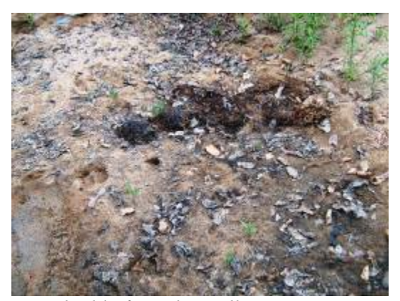
River bed before shramdhaan