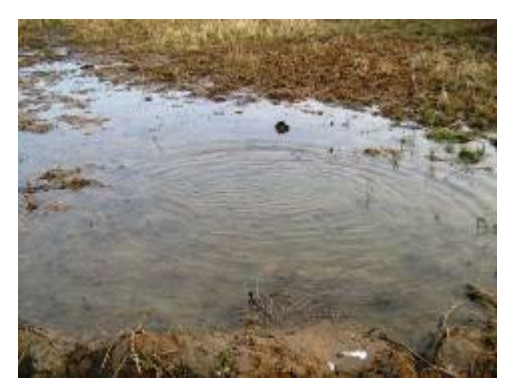
Water body created after shramdhaan at Budbudi Nallah, Chapri