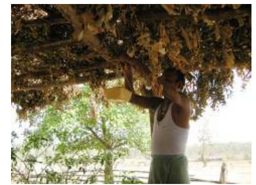
Water pot being prepared at Nayakheda and being hung up for birds to quench their thirst