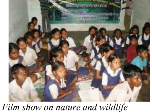
Film show on nature and wildlife conservation at Nandkot, Satpura