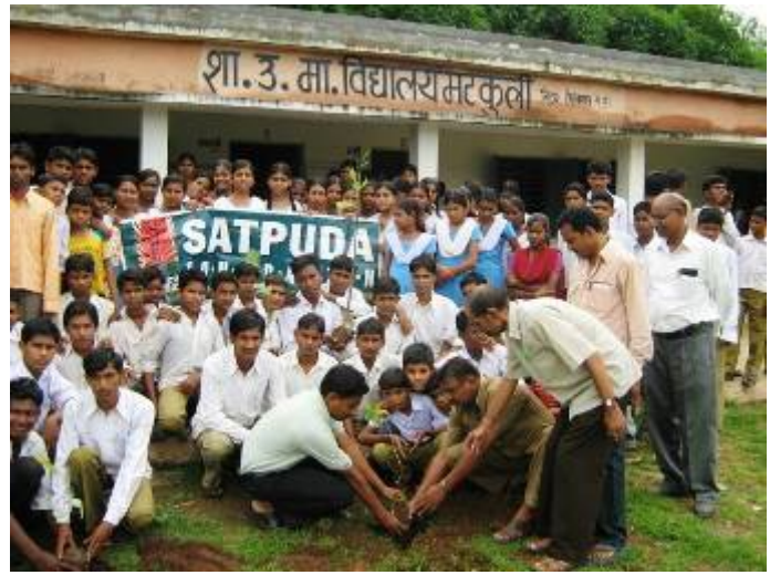
School teachers launch plantation programme at Matkuli High School