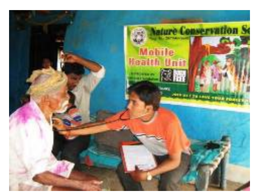
Medical camp at Anjandana

A list of our camps is available in Annexure 4. Detailed monthly reports are available on our Web site www.satpuda.org