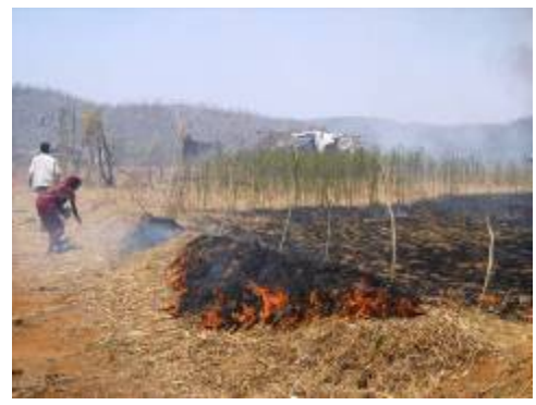
Fighting fire near Birjikhapa village