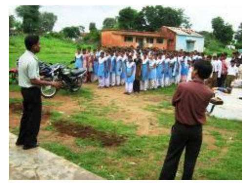
Awareness programme on plantation at Matkuli High School