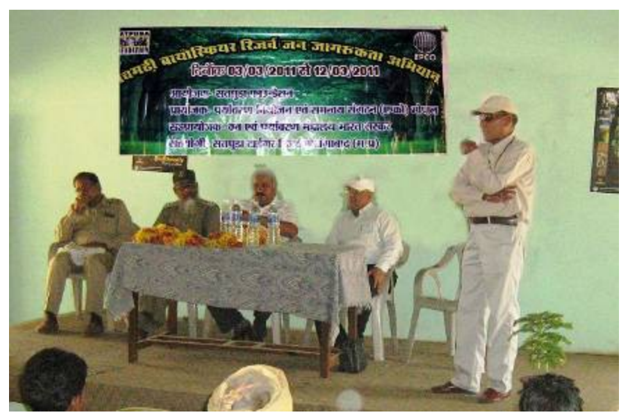
Workshop on Pachmarhi Biosphere Reserve in progress at Matkuli, Satpura Tiger Reserve

As part of the programme, we also organised conservation rallies in 10 villages between on March 3 and March 12. We also organised drawing contests in 1 school and a group discussion on conservation in 1 school.