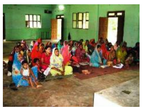
SHG workshop cum training programme at Matkuli, Satpura Tiger Reserve