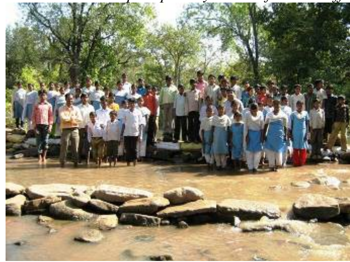
Shramdhaan volunteers pose proudly at site after their efforts!!!