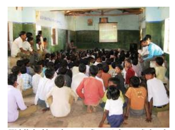
Wildlife film show at Govt Ashram School, Matkuli, Satpura Tiger Reserve