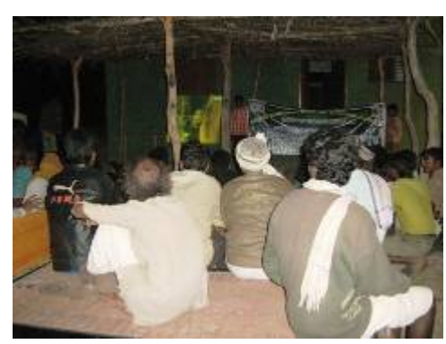
Film show on wildlife at Sonpur