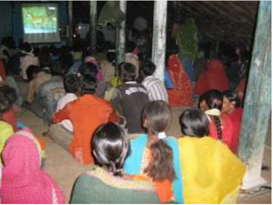
Wildlife film show at Raikheda village, Satpura Tiger Reserve