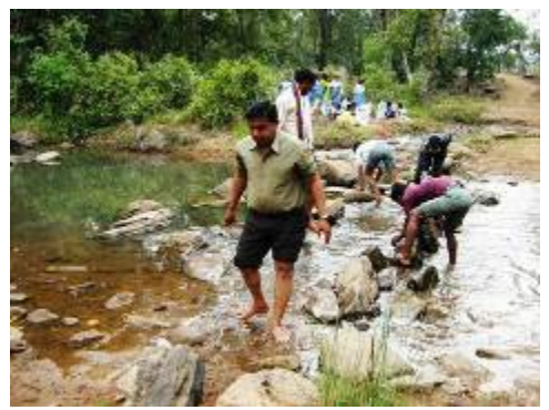
Headmaster of Govt Middle School, Anjandana works with colleagues on stop dam