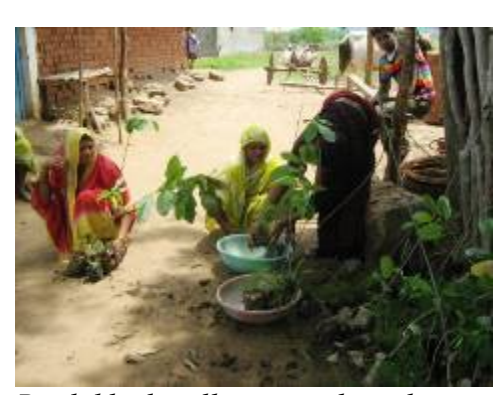
Bindakheda villagers with saplings