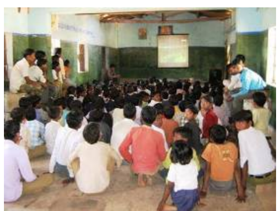
Wildlife film show at Govt Ashram School, Matkuli, Satpura Tiger Reserve