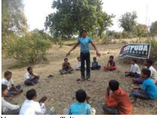
Nature game at Telia