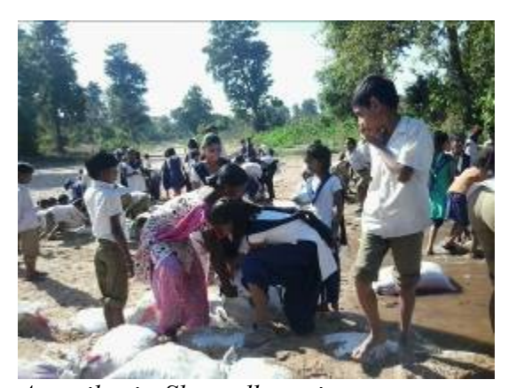
Aamajhari - Shramdhaan in progress