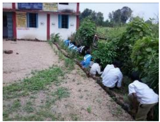
Plantation programme at Khamrith