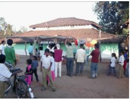
Khamrith - Villagers await treatment at our free medical camp