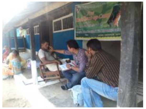
Turia - Doctor examines patient at medical camp