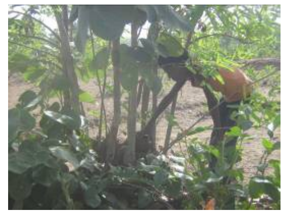
Village youth installs water pot for birds near Satosha