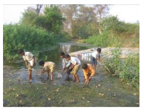
Cleaning of water body at Khamba