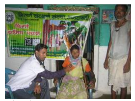
Medical camps at Kokiwada and Durgapur