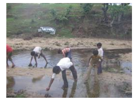
Cleaning of water body near Turia