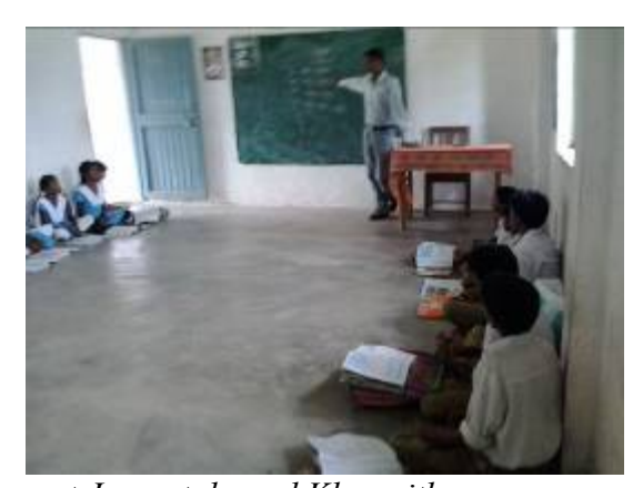
Environment education programme at Jamuntola and Khamrith