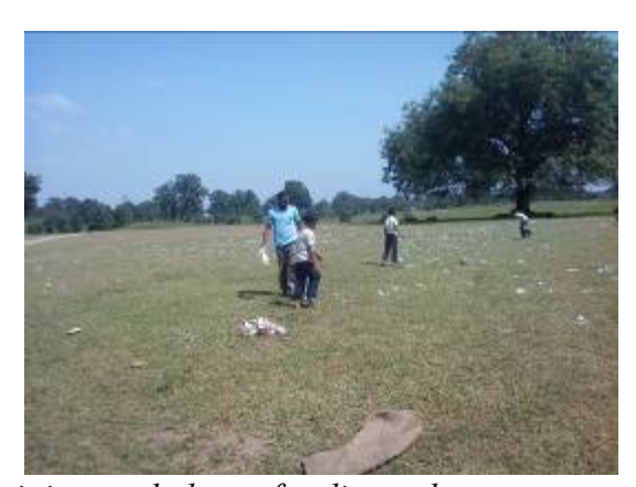
Team collects plastic litter, loads it into ambulance for disposal