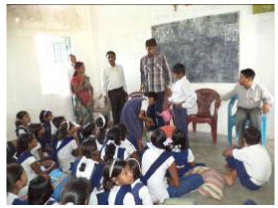
Conservation and hygiene rally on World hand wash day at Telia