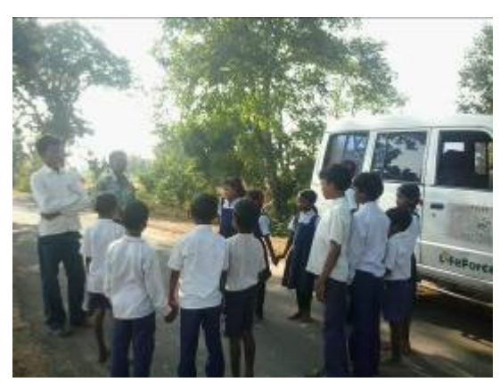
Nature trail programme for the children of Durgapur village