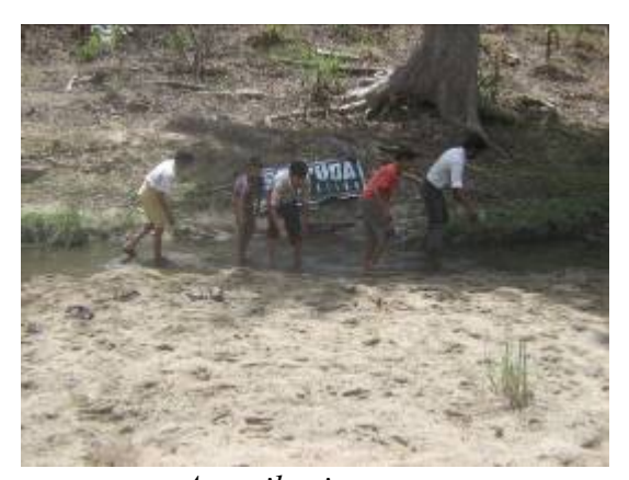
Cleaning of water body in progress at Aamajhari