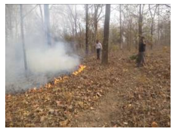
Niranjan assists Forest Department staff in fighting fire in forest near Jamuntola