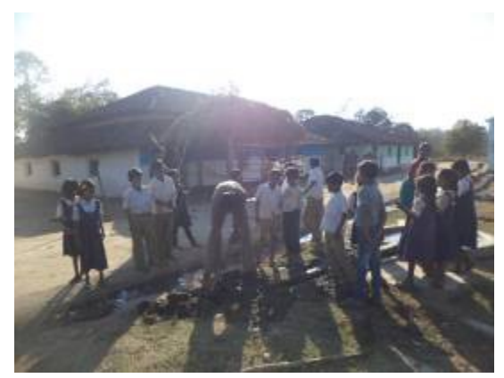
Shramdhaan to clean area next to hand pump at Khamba