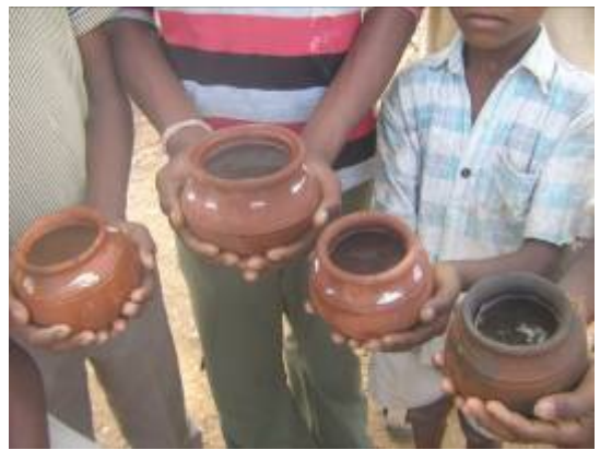
Water pots being prepared for birds at Satosha