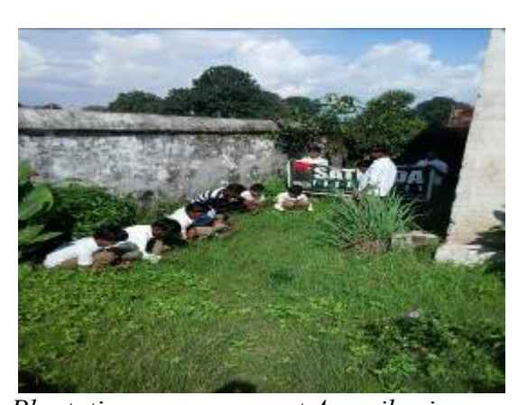
Plantation programme at Aamajhari