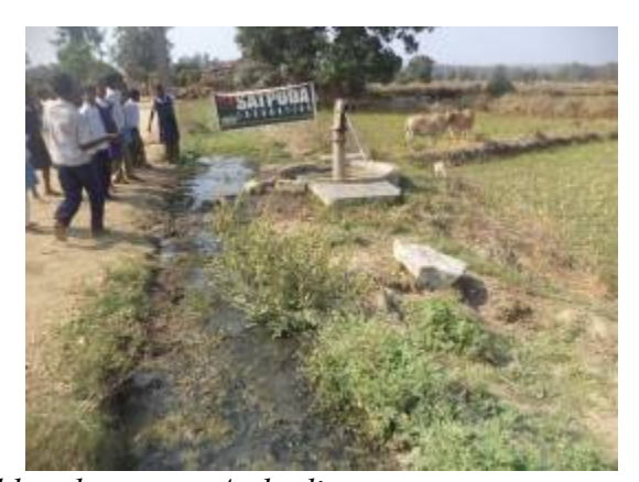
Cleaning of area around hand pump at Ambadi