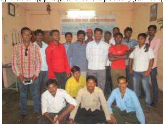
Chorgaon - Youths who underwent training in poultry farming