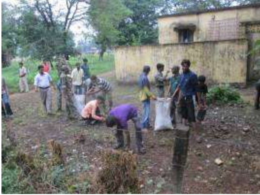
Moharli - Guides and villagers pick up plastic litter during our anti-plastic programme organised during Wildlife Week