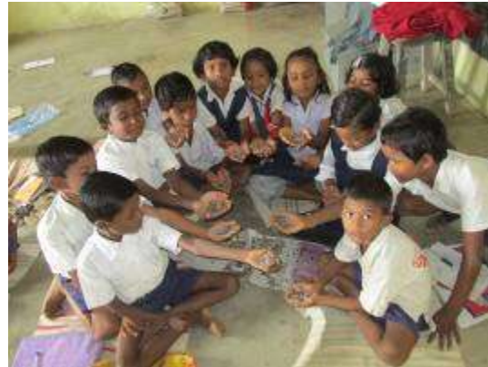
a)Kutwanda - Children tend to saplings planted by them last year b)Moharli - Students collect seeds of native species for planting during monsoon