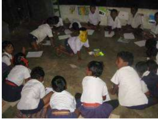
Kondegaon - Children participate in drawing contest organised by us to celebrate World Forestry Day