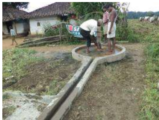
Area around hand pump after programme