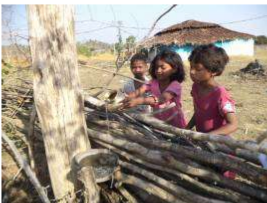
Chapri - Village children set aside precious water for birds