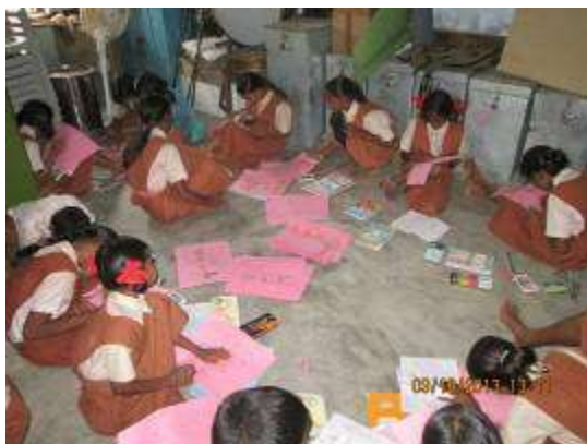
Moharli - Drawing contest at Zilla Parishad Middle School during Wildlife Week