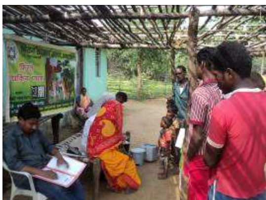
Pahami - Free medical camp in progress

A list of the health camps is available in Annexure 4 .