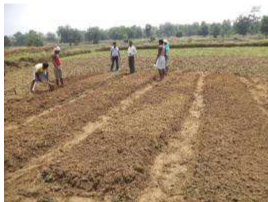
Batwar - Trainer from Ajiwika and Amit conduct programme on improved farming technique