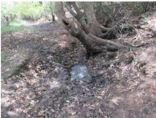
Moharli - Water body clogged with