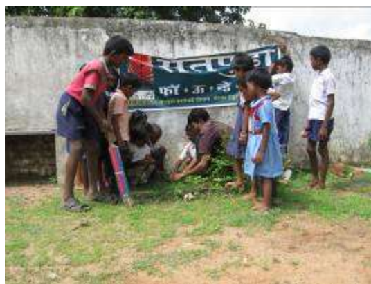
Adegaon - Plantation programme at Primary School