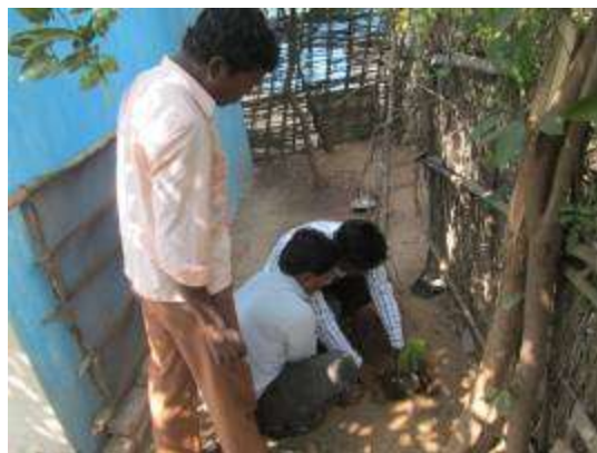
Sapling plantation at Sitarampeth