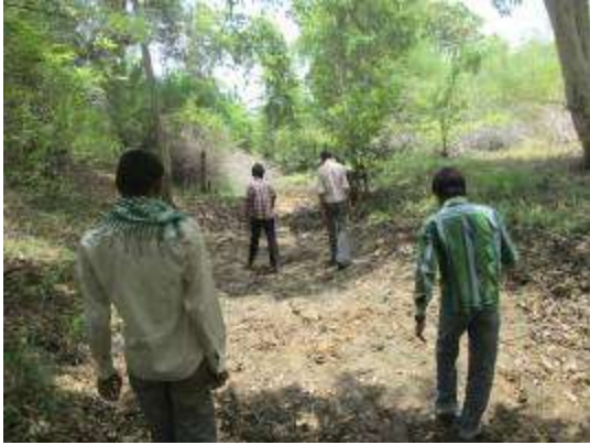
Moharli - Youngsters on nature trail organised by us