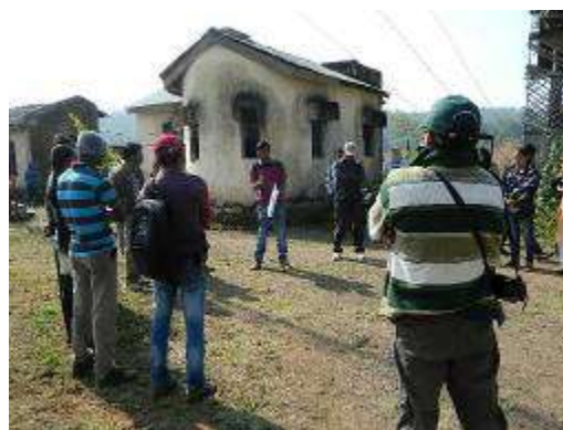
Pictures: Participants at the Kund meadow and also visited protection camp there.