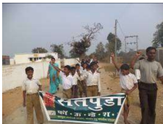
Conservation rally in Satosha