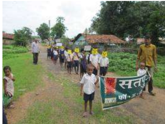
Kondegaon - Children rally in support of the tiger on World Tiger Day