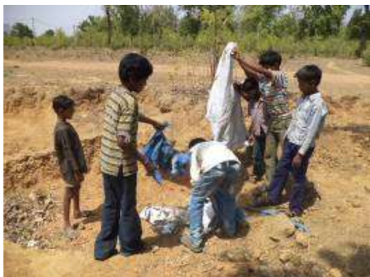
Chapri - Kids gather plastic and polythene litter to be buried in pit