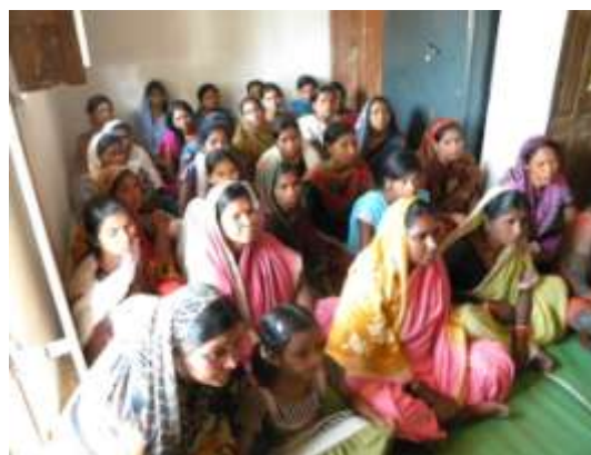
Mangezari - Women and young girls attend meeting on livelihood opportunities