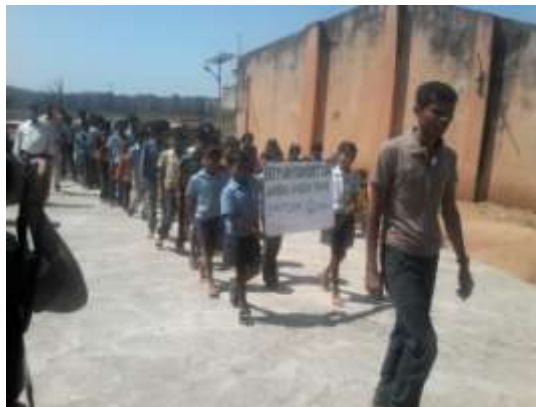
Nature awareness rally on World Wildlife Day at Kolutmara village