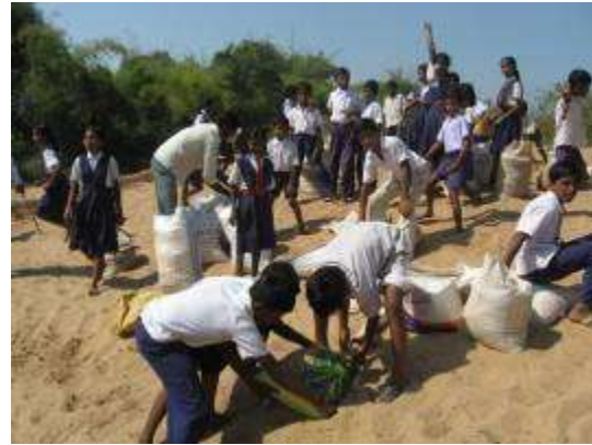
Chorgaon - School children get together to build check dam