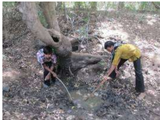
Moharli - Bandu and volunteer clean