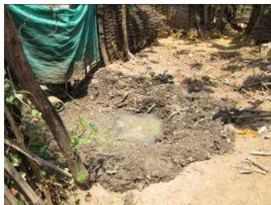
Katwal - Soak pit after our clean-up programme