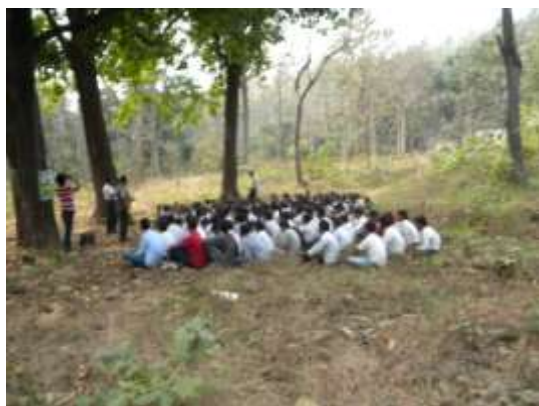
Students of Bolunda High School on nature trail with our team at Pongezara at