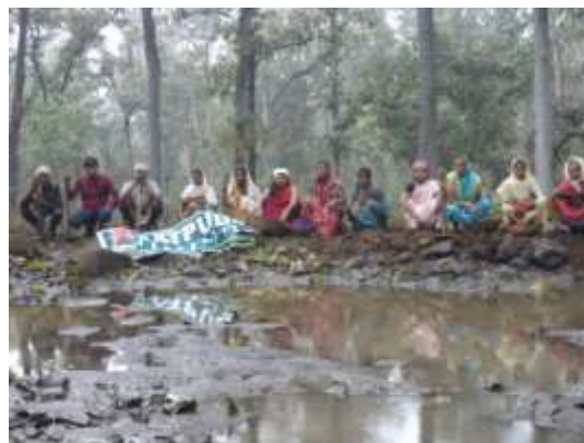
Bhagpur - Volunteers pose on top of check dam built by them