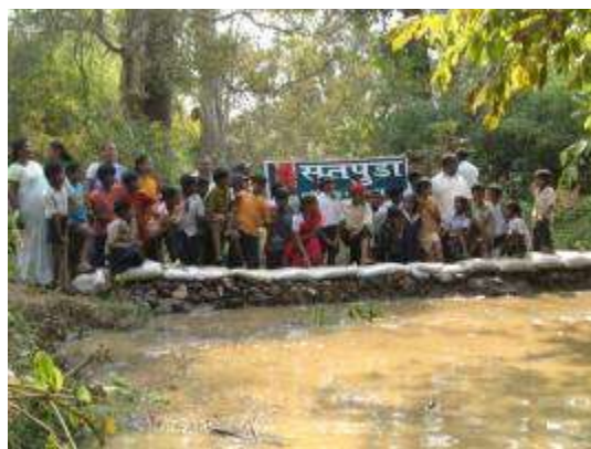
Moharli - Team poses after building check dam