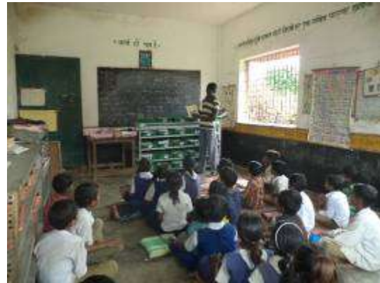
Environment education programme at Manegaon (left) and Chapri (right)