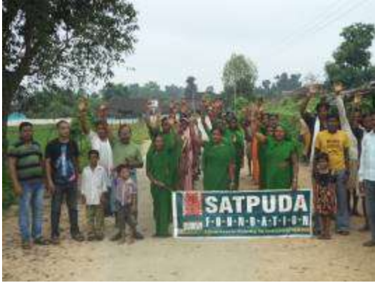
Kutwahi - Members of women's SHG get ready for conservation rally