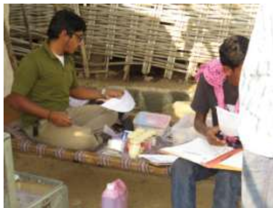
Free medical camp at Ghatkukda village