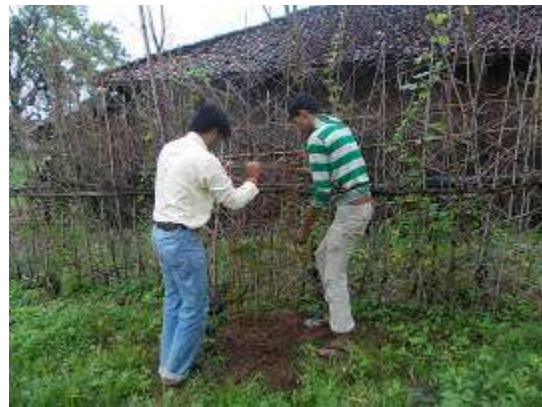
Bandu, school students and school staff plant saplings and fit wire cage for protection of plants