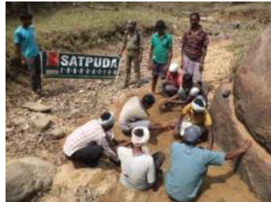
Batwar - Volunteers dig waterhole in jungle under supervision of forest guard