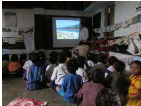
Kondegaon - School children enjoy film show on nature and wildlife