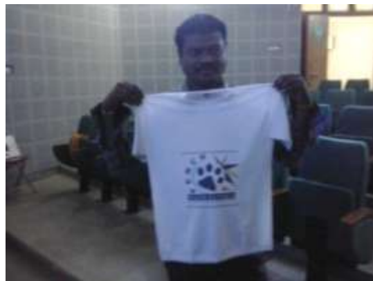
Villager shows T-shirt with image printed on it during training programme