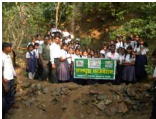
Volunteer team from Bolunda poses after building check dam