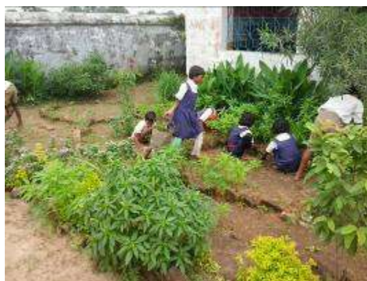
Preparation of new sites for plantation and cleaning of the school campus at Aamajhari