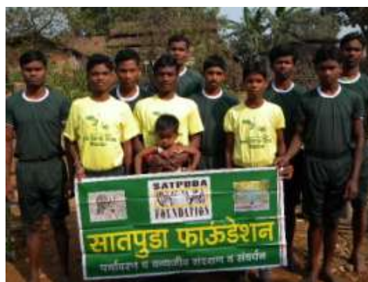
Mangeshwari - Conservation message printed on T-shirts gifted by us to kabaddi team