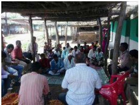
Meeting at Kirangisarra on relocation