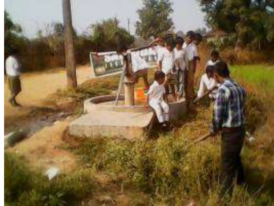
Work in progress to clear the area around the hand pump at Ambadi