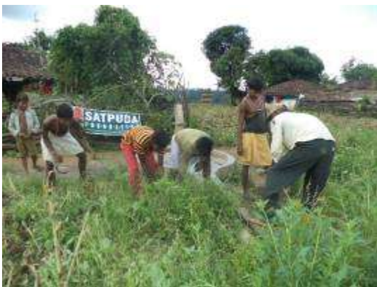
Team works to remove wild growth