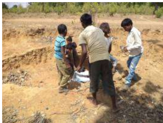
Chapri - Children bury plastic and polythene waste in pit