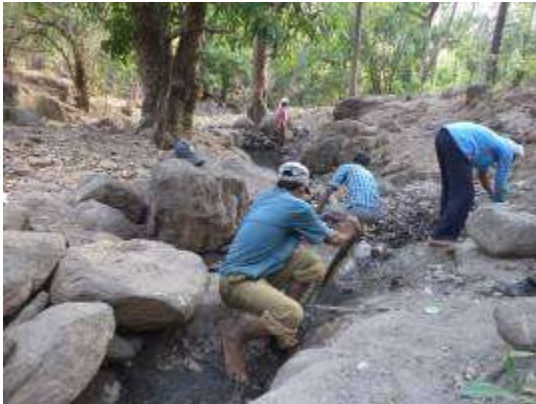
Batwar - Team cleans stream leading to waterhole