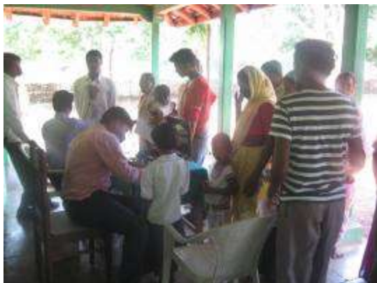
Karva - Villagers come for treatment at our free medical camp