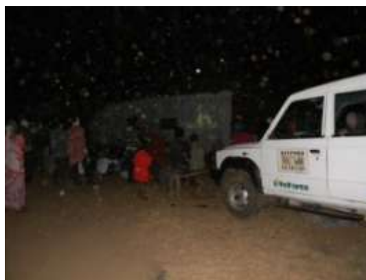
Mangezari - Villagers enjoy film on wildlife conservation