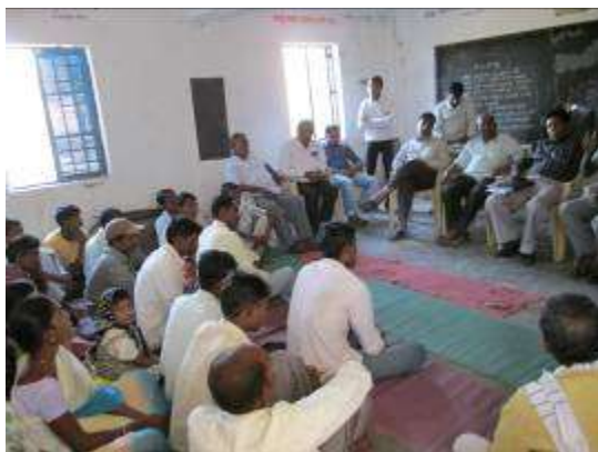
Junona - Awareness programme on forest fires