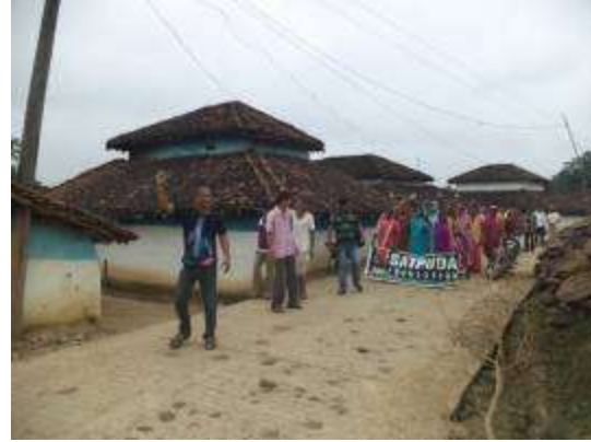
Chapri - Amit Awasthi leads SHG on a conservation rally through village