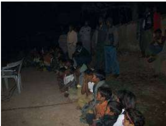
Manegaon - Villagers watch film on wildlife and nature