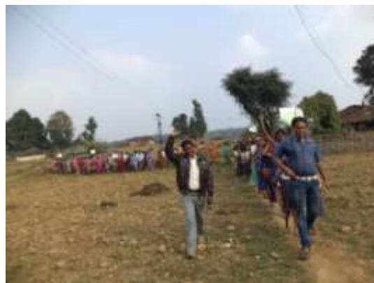
Dhamangaon - Participants chant slogans for conservation on rally organised by our team