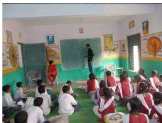
Environment education programme at Teliya (left) and Doodhgaon (right) schools