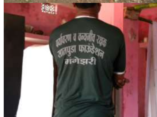
Bolunda - School students collect plastic litter from temple premises adjoining local Tiger Reserve