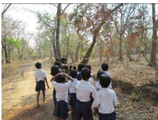
Sitarampeth - Village children learn about plants on nature trail organised by us