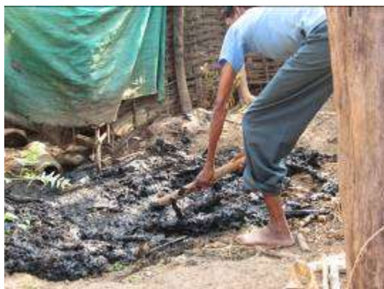
Katwal - Soak pit being cleaned up