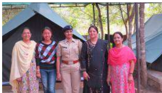
Pictures: Classroom session at Melghat community centre. Participants in front of their tents.

Participants were given a task to visit tourism centre at Semadoh in Melghat and find out shortcomings and solutions to communicate message of tiger conservation effectively.