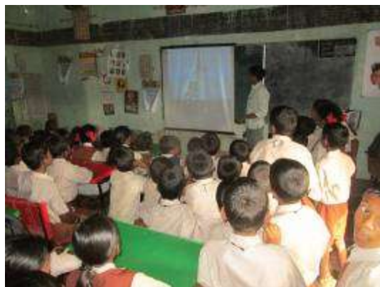
Adegaon - Wildlife film show in progress