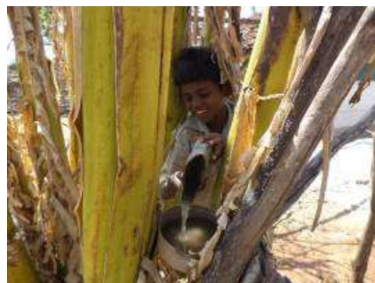
Manegaon - Village child sets up water pot for birds