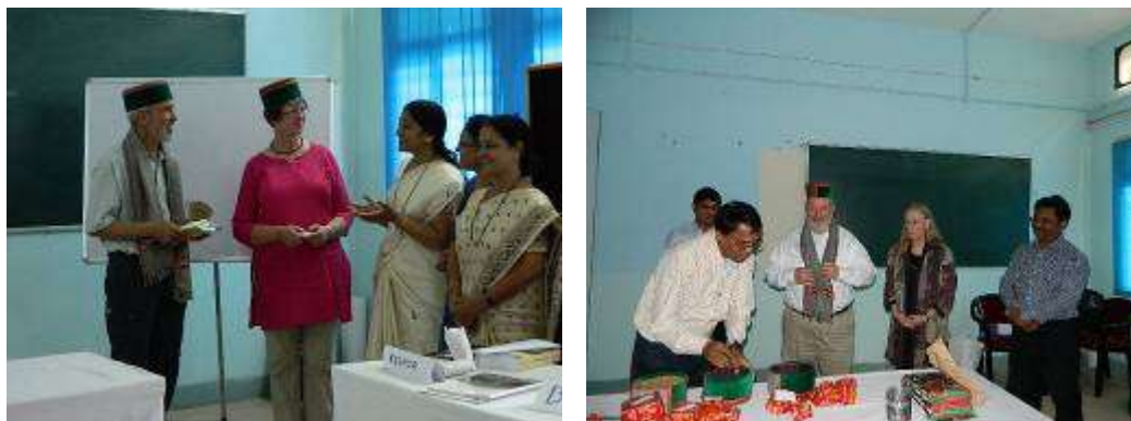
Pictures: Participants and instructors exchanging mementoes.