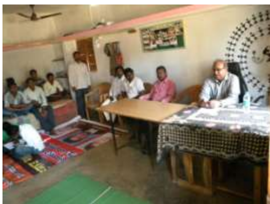
Mangezari - Official of Star Rojgar Kendra talks to village youths about livelihood training programmes

Details of our livelihood-related activities are available in Annexure 4 .