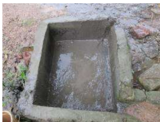
Kutwanda - Water tank cleaned by our volunteers