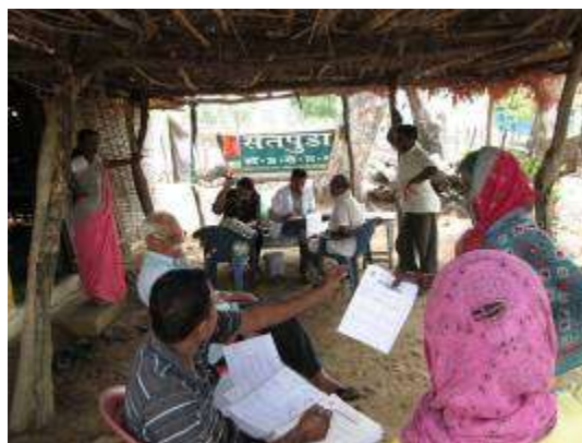
Jamni - Villagers get free treatment at our medical camp