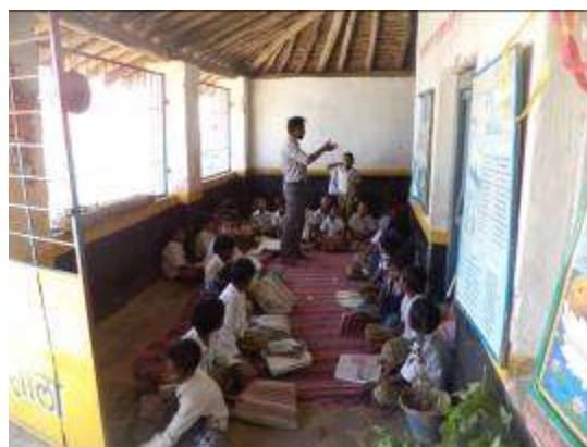
Environment education programme at Ambadi (left) and Aamajhari (right)