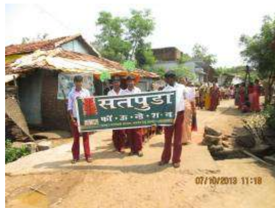
Moharli - School children start out on conservation rally organised by us