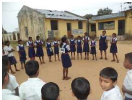
Children at Pipariya School learn conservation message through nature games