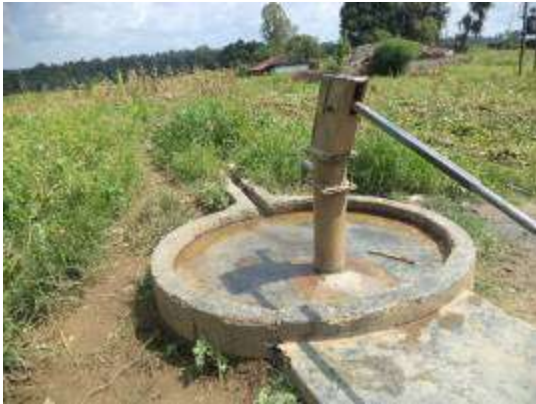
Samaiya - Wild growth proliferating around hand pump