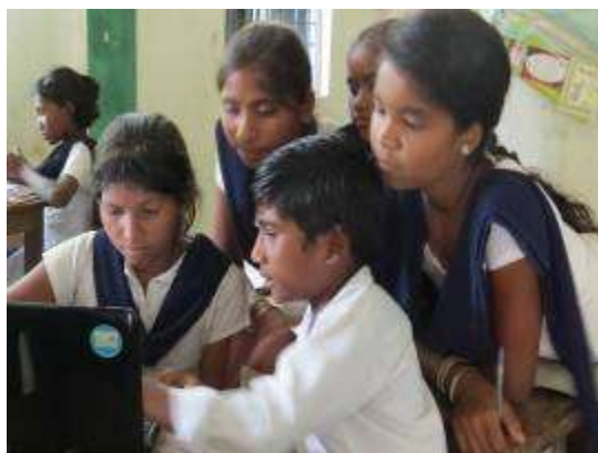
Children from Teliya practicing computer skills learnt from our programme