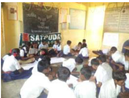
Drawing competition on the occasion of World Wildlife Day at Ghoti (left) and Kolutmara (right)