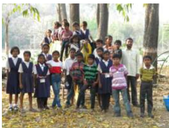
Students of Mangezari on nature trail who organised by our team on