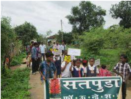
Dewada - Children take out rally on World Tiger Day in support of the