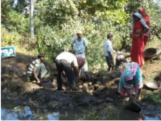
Bhagpur – Check dam being built