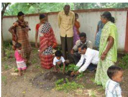
Adegaon - School teacher plants sapling in programme organised by us