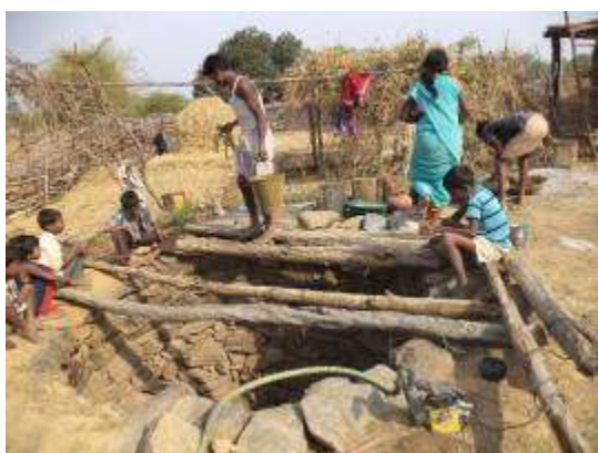
Bhagpur - Cleaning of well in progress