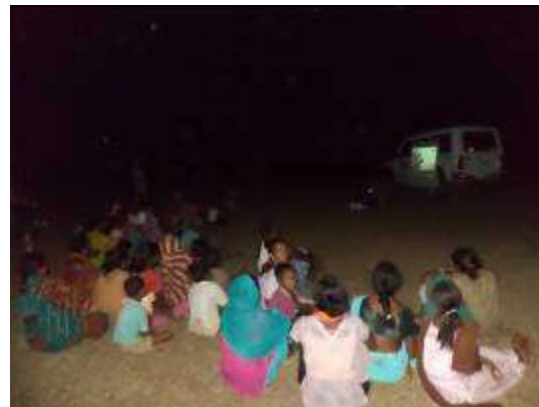
Chapri - Film on wildlife and nature being shown to villagers by our team