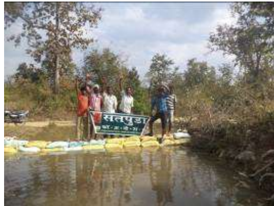
Check dam built by our volunteers near Satosha