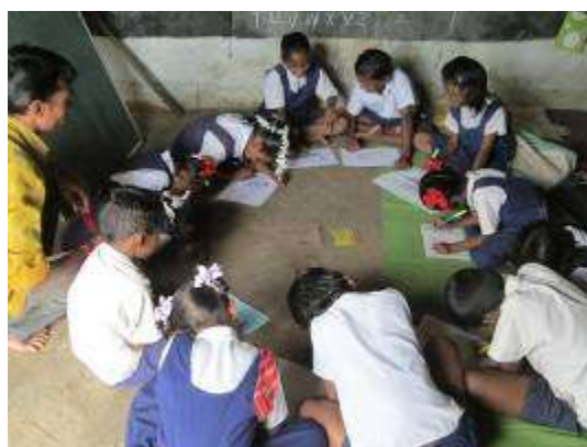
Sitarampeth - Children engaged in drawing contest on World Tiger Day