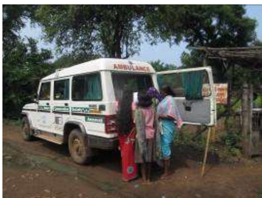
Jamni - Villagers collect free medicines from ambulance at camp held at forest guard's quarters