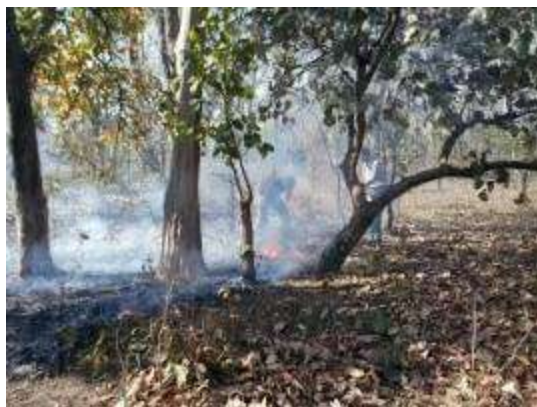
Durgapur - Niranjan Hinge assists in fighting fire in forest