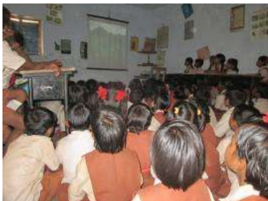
Chorgaon - Students of Middle School watch film on nature and wildlife conservation