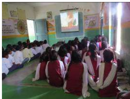
Film shows at Ambadi (top-left), Khamrith (top-right) and Doodhgaon (bottom)