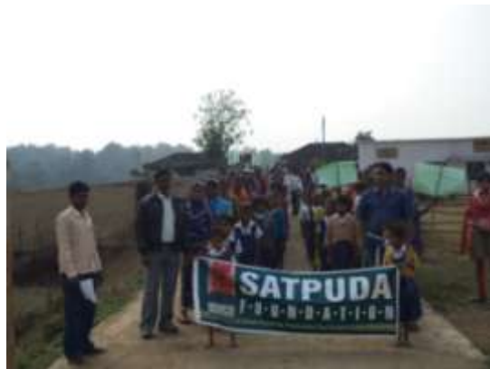
Dhamangaon - School students and members of women's SHGs about to start conservation rally organised by our team