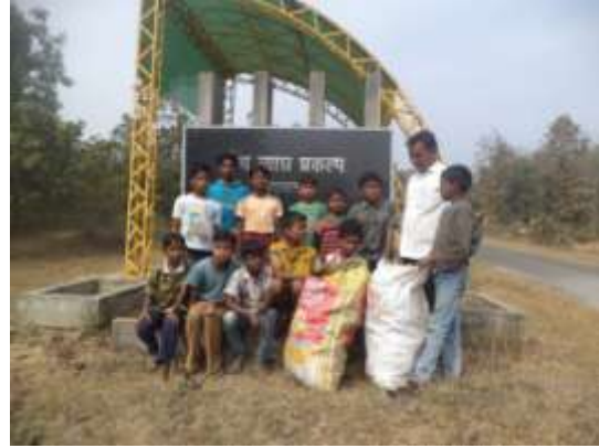
Anti-plastic drive on road from Pipariya to Sillari