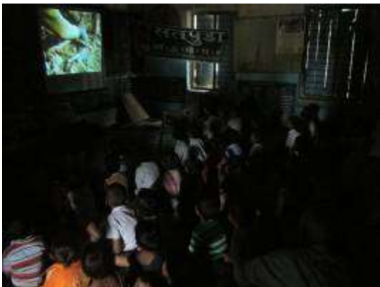
Kutwanda - School students watch film on wildlife and nature