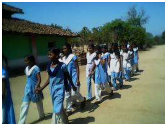
Awareness rally in Khamrith on World Wildlife Day