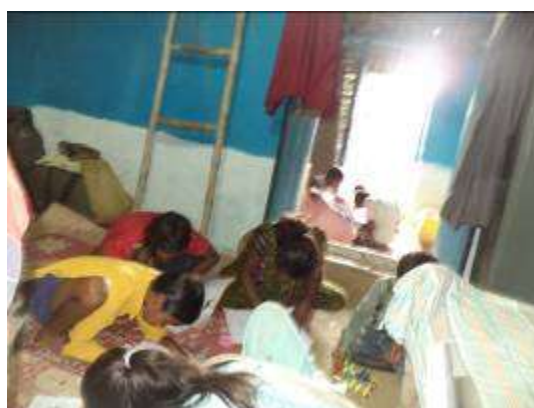
Drawing and painting contest at Turia on "Nag Panchami"