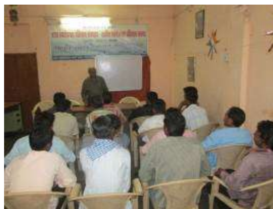
Chorgaon - Bandu (left) and R-Seti official (right) speak to village youths at inauguration of training programme on poultry farming