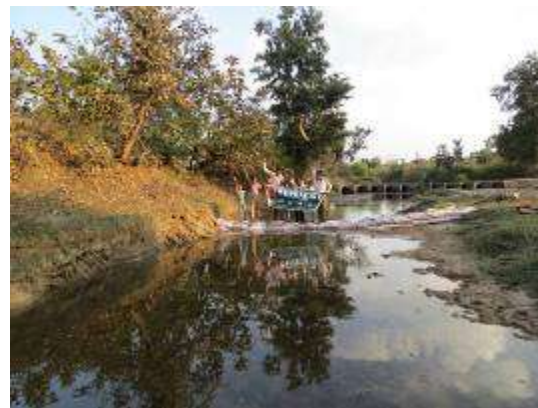
Programme to build a stop dam near Turia village