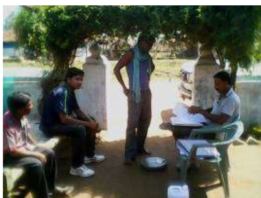
Patient Registration at Durgapur