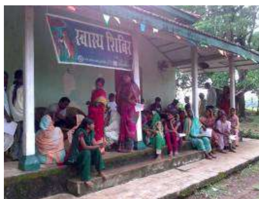
Medical camp at Ghatpendari