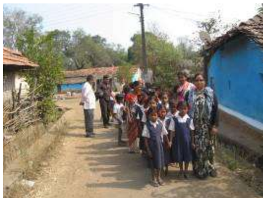
Kutwanda - School children and teachers set off on conservation rally on occasion of Maharashtra Day