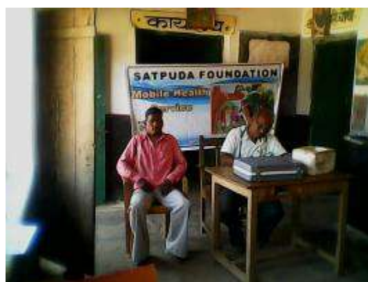
Doctor prescribing medicine at Ambadi