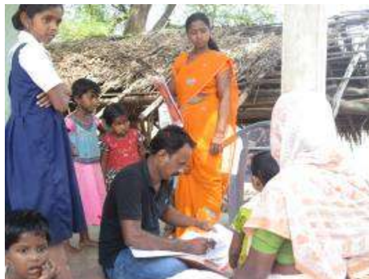
Pangdi - Mother looks on as her child is registered for treatment at our camp