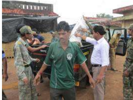
Moharli - Guides and villagers pick up plastic litter during our anti-plastic programme organised during Wildlife Week