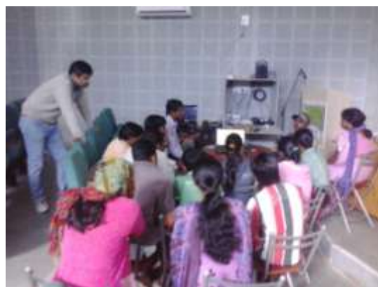
Training programme in progress