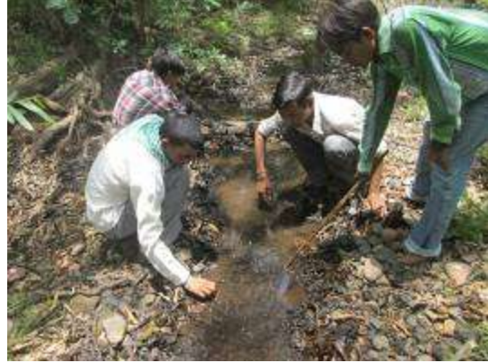
Moharli - Volunteers remove organic litter and leaves from waterhole