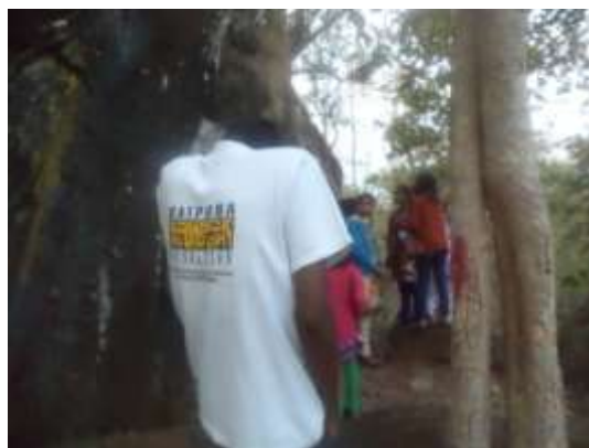
Sillari nature camp - Presentation on wildlife (left) and nature trail (right)