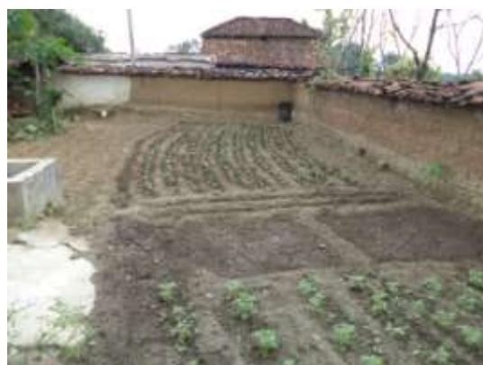
Patpara - Vegetable patches set up with our help at Dinesh Maraskole's house