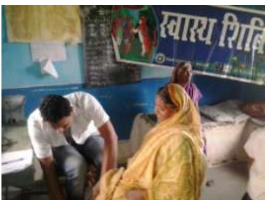
Medical camp at Khapa