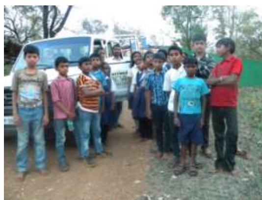
Students of Mangezari village school were taken by Satpuda Foundation game drive in Tiger Reserve