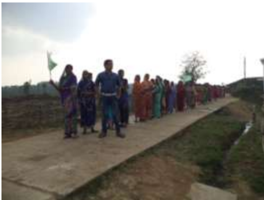
Batwar - Amit Awasthi leads members of women's SHGs and school students on conservation rally