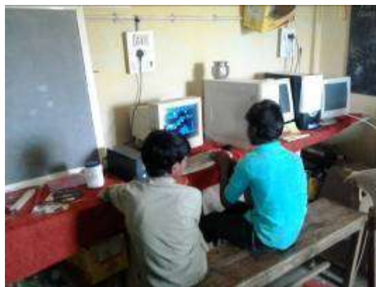
IT education programme for students of Sawara village