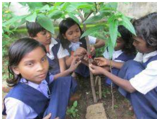
Dewada - Children tie rakhis to saplings and affirm their support to protect trees