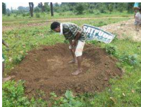
Sautiya - Compost pit prepared with our assistance