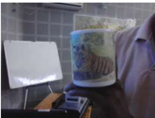
Cup with image of tiger printed on it at our training programme