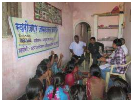
Awareness programmes on self-employment at Bamdeli (left) and Moharli (right)