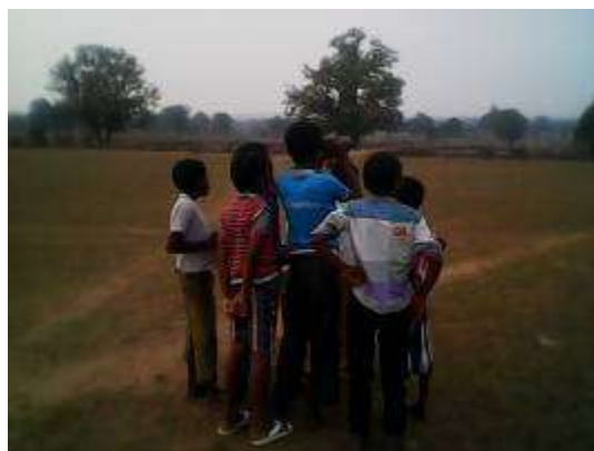
Nature trail for the students of Turia village near Kohoka lake