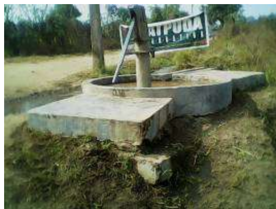
Before (left) and after (right) our programme at Ambadi