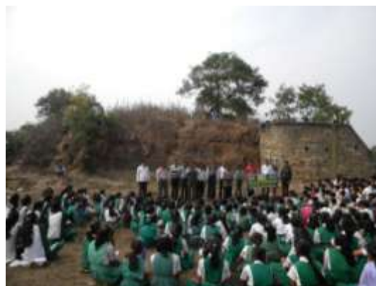
Students from Kodelohara listen to conservation message on nature trail