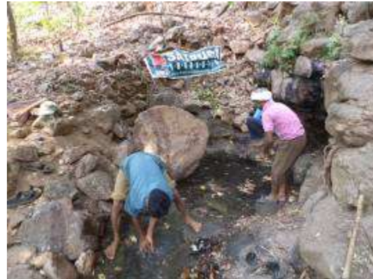
Team removes organic litter from waterhole at Batwar