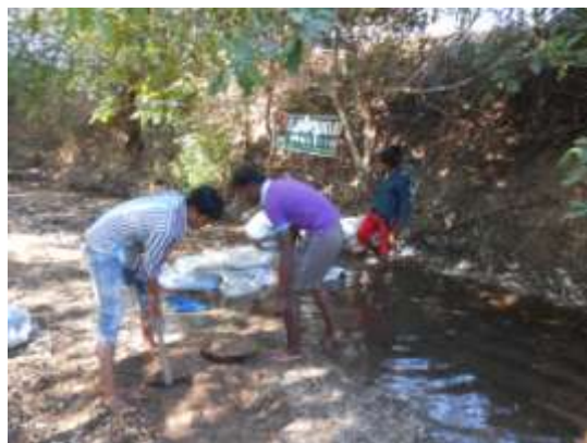
Villagers and VEDC members of Khapa village building check dam