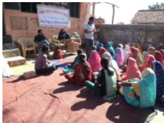
Workshops on SHGs organised by Satpuda Foundation and Ajiwika at Dhamangaon (left) and Tilri (right)