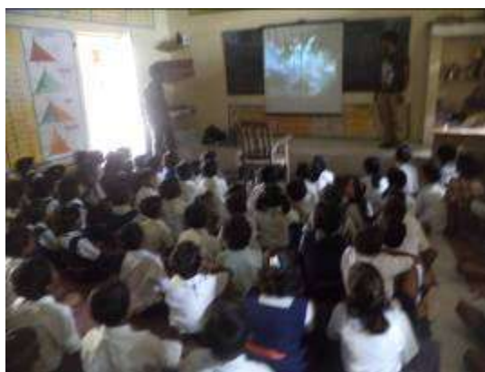
Saket talks to students at Sawara on nature and wildlife conservation during film show