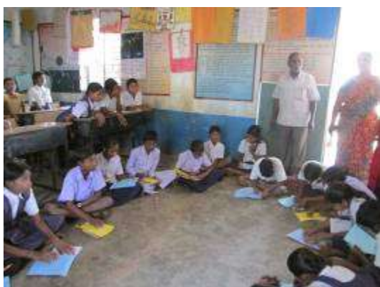
Moharli - Children participate in drawing contest to celebrate Maharashtra Day