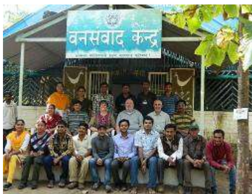
Pictures: Participants in the field. Group picture at the community centre at Melghat