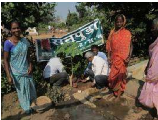
Sapling plantation at Bamdeli