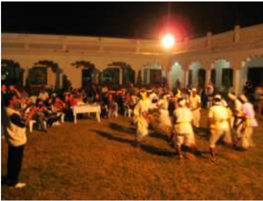
Tribal dance by villagers from Sawara at Go Flamingo Resort