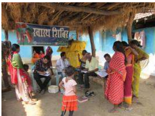
Adegaon - Villagers register for free treatment at our medical camp