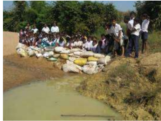
Chorgaon - Water starts to accumulate as volunteers pose after building check dam