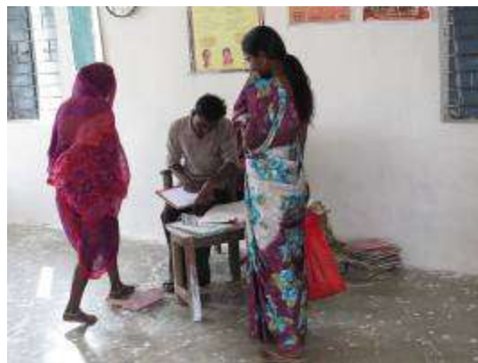
Teliya - Doctor examines patient's x-ray (left) while patients register for free treatment (right)