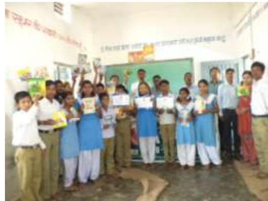
Mocha - Some prize winners of contests held during Wildlife Week at Middle School