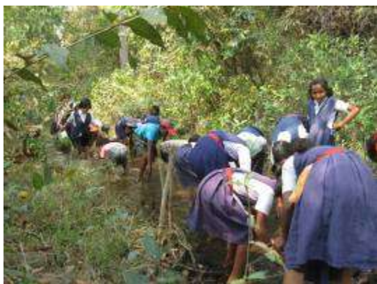
Moharli - School students participate in programme to build check dam

Detailed monthly reports are available on our Web site www.satpuda.org