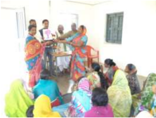
Kutwahi - Women's SHG members get mementoes for participating in Wildlife Week activities