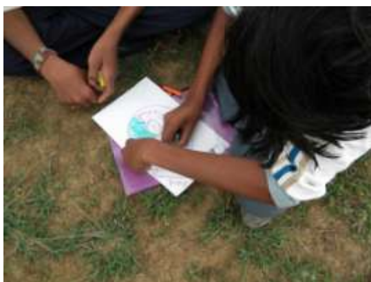
Bolunda - Students participate in drawing addresses contest organised by us on World Forestry school Day