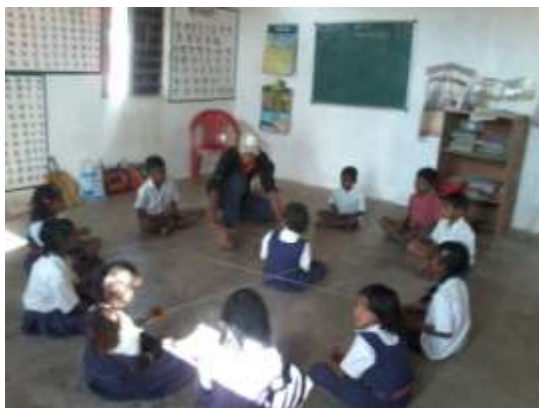
Students playing nature games at Kirangisarra (left) & at Sawara village (right)