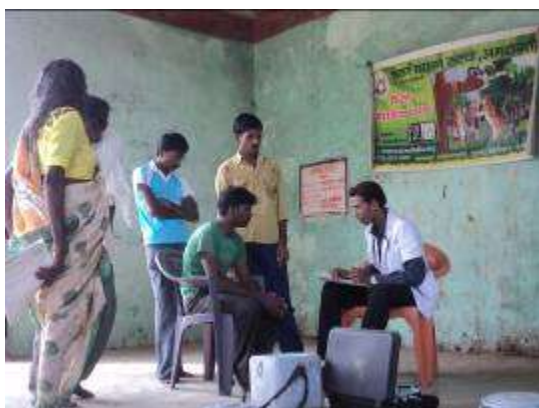
Bhagwanpur - Doctor examines patient