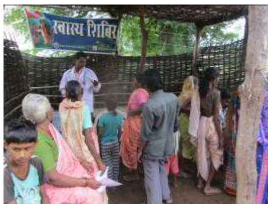
Dewada - Villagers register for treatment at our free medical camp