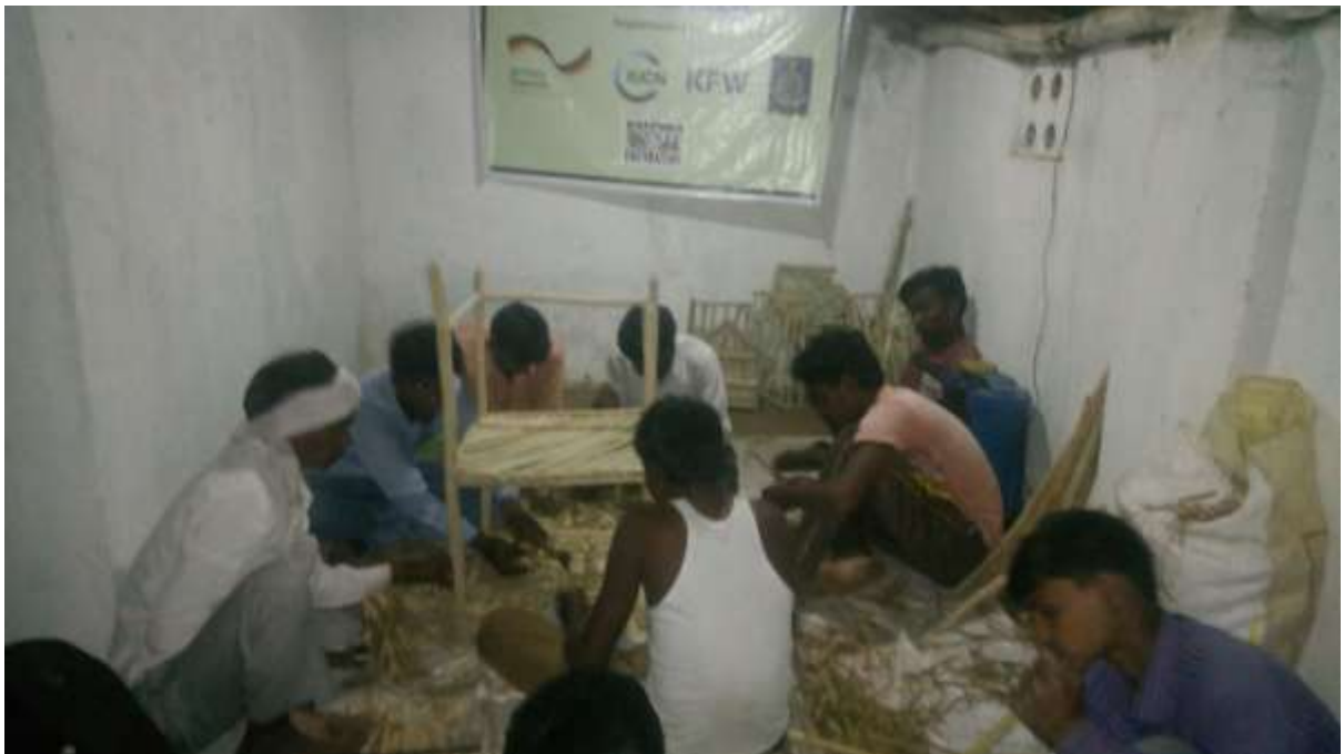
Pench-Bor corridor, Bidgaon – Villagers learn to make products from lantana in programme organised by us