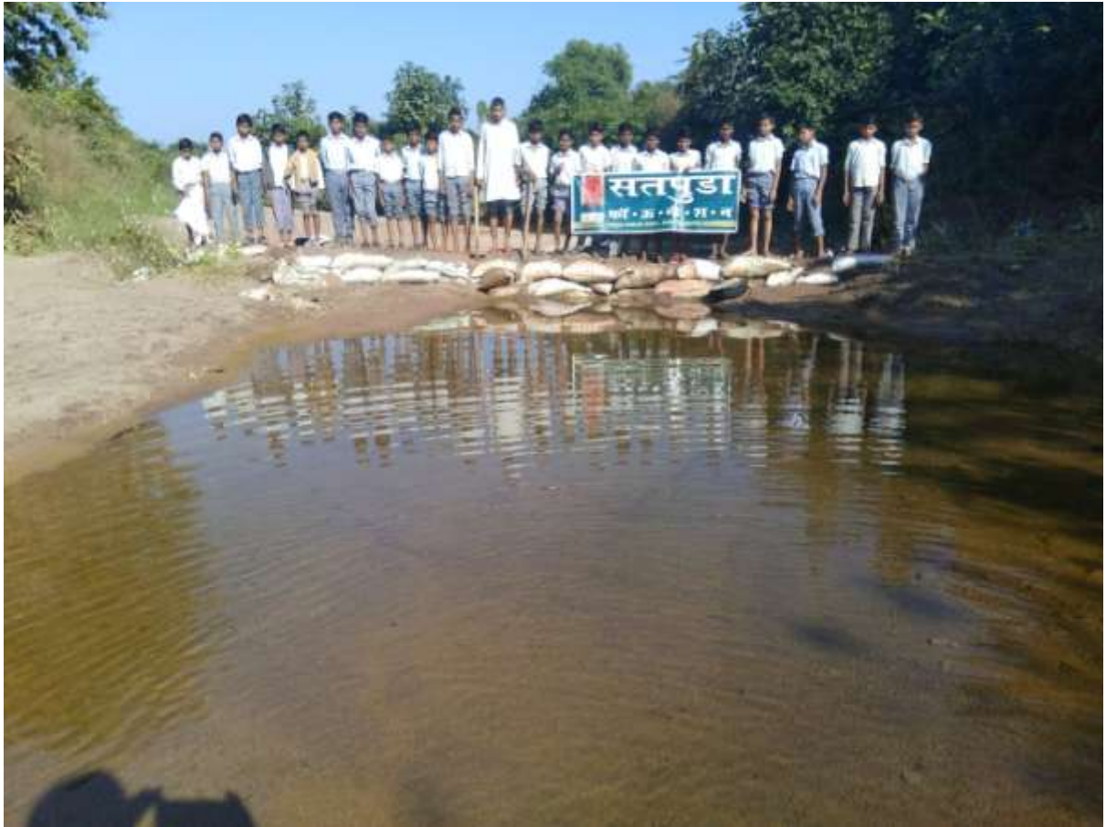
Satpura Tiger Reserve – Check dam built at Maili Nallah, near Matkuli by volunteers organised by us