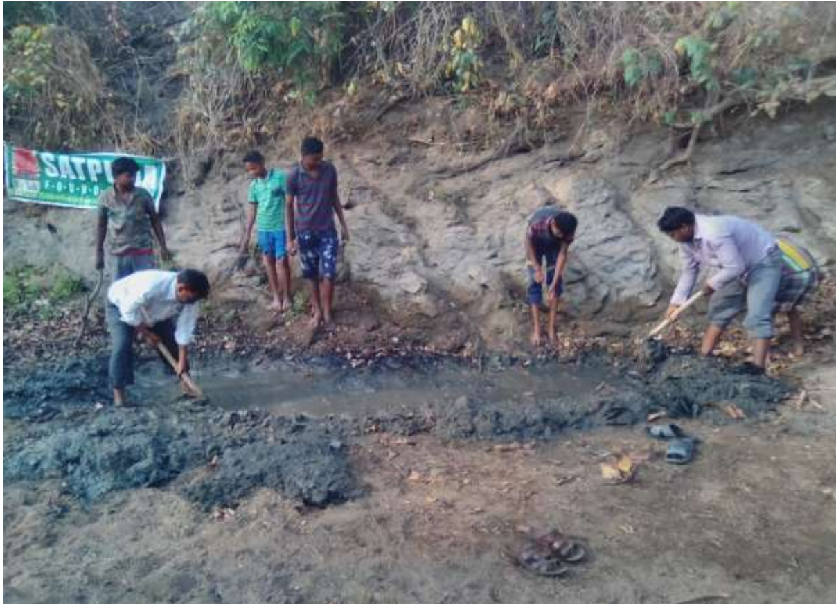
Pench Tiger Reserve (Maharashtra), Ghoti – Villagers clean and de-silt waterhole in jungle in a programme organised by us