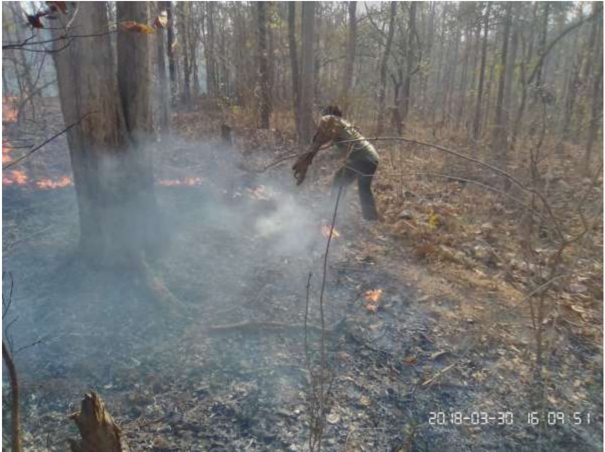
Pench Tiger Reserve, (Maharashtra), Kirangisarra- Our colleague Dilip Lanjewar helps Forest Dept. staff and villagers in fighting forest fire