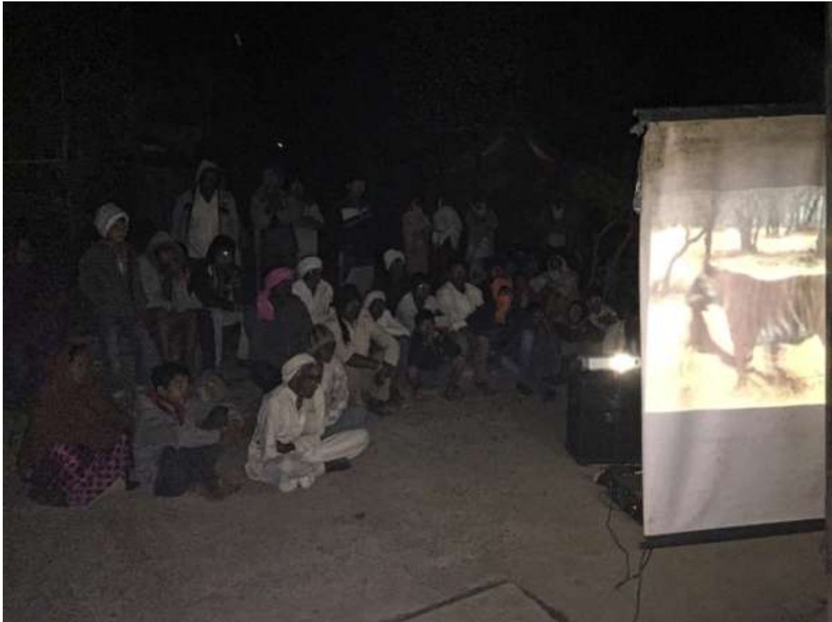
Pench-Bor corridor, Umri – Villagers watch film on wildlife conservation