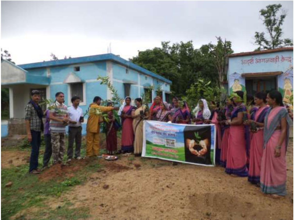
Kanha, Mocha – Members of women's SHG collect saplings distributed by us