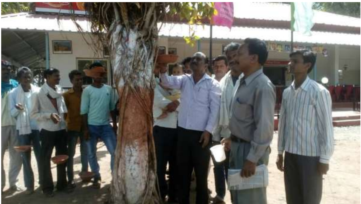
Satpura Tiger Reserve, Matkuli – Villagers fix container with water for birds in summer