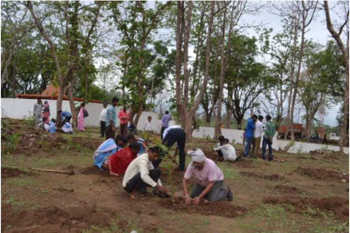
Satpura Tiger Reserve, Matkuli – Villagers plant saplings in plantation programme organised by our team