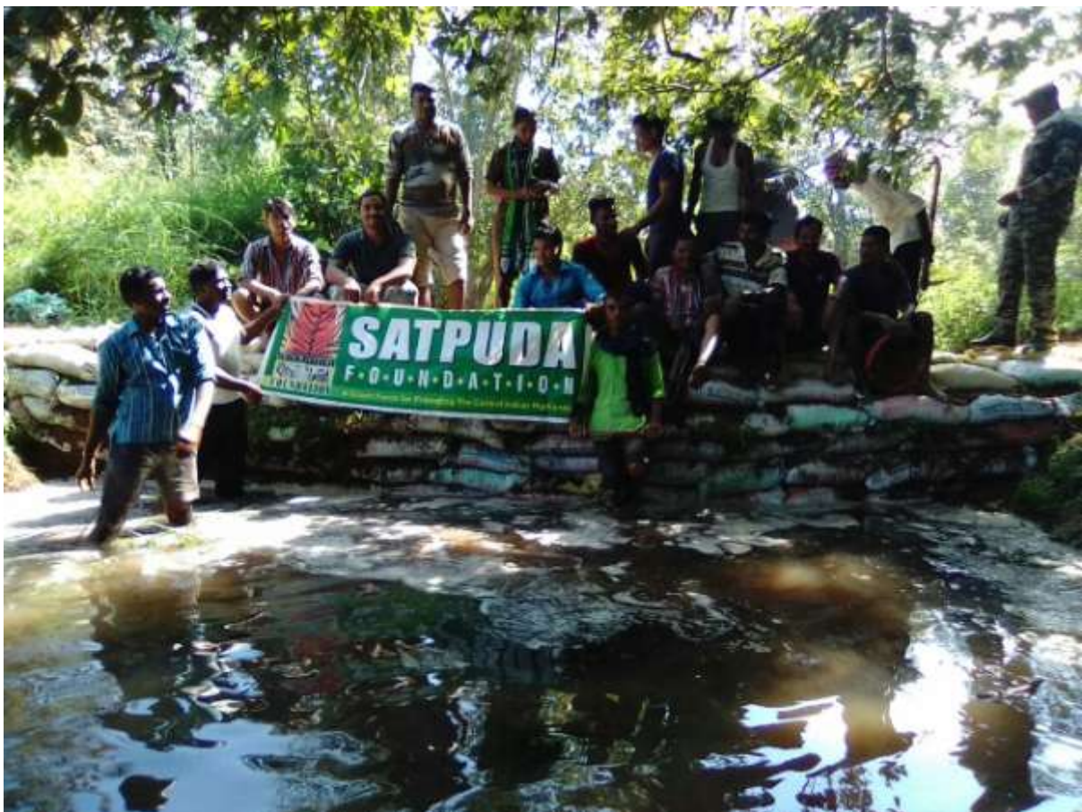
Pench Tiger Reserve, Sillari – Check dam built in jungle in programme organised by us

To ensure that wildlife got proper access to water, we cleaned and de-silted a total of 111 waterholes located inside jungles across the landscape. These waterholes were clogged with organic litter and, in some cases; the water was barely visible beneath the scum.