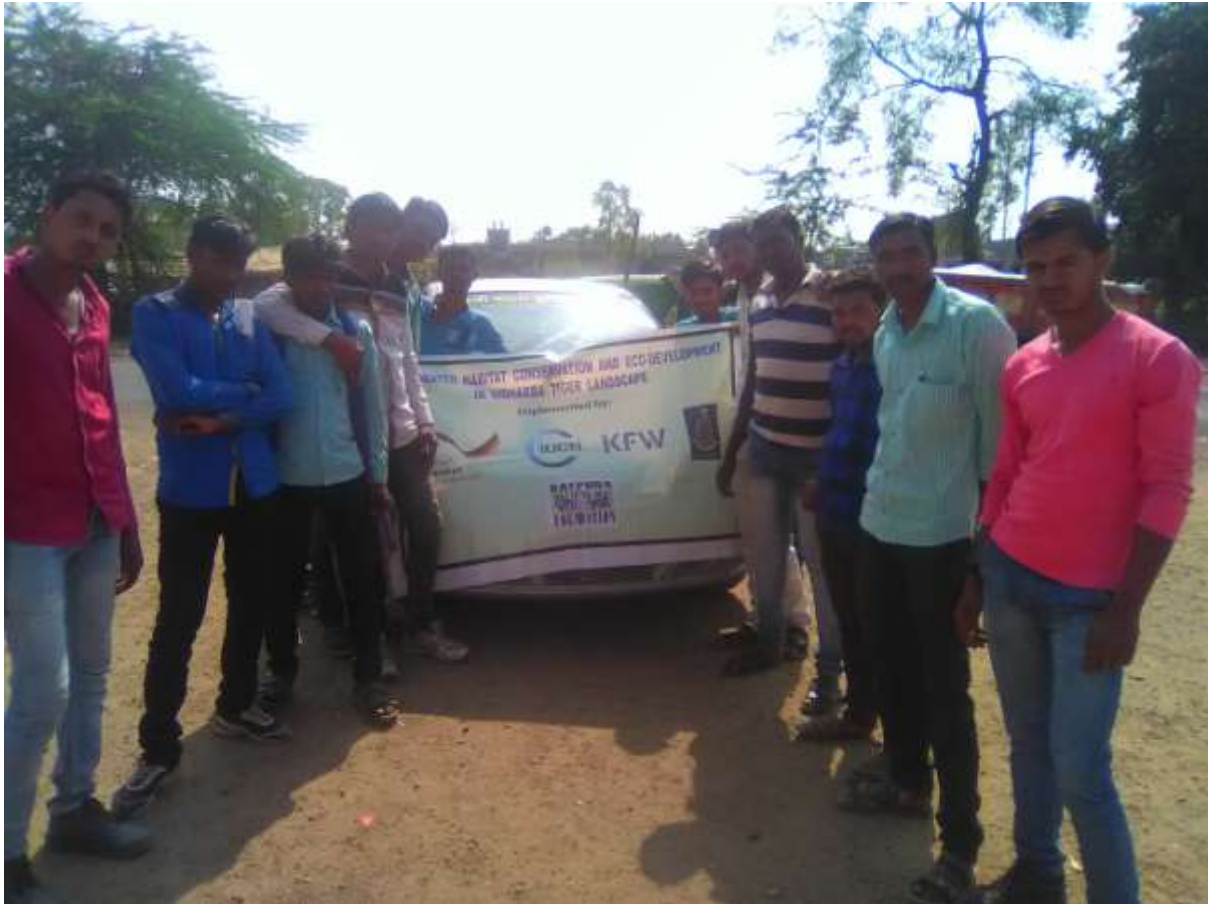
Melghat-Yawal corridor, Zari – Youths from local villages learn driving in programme organised by us