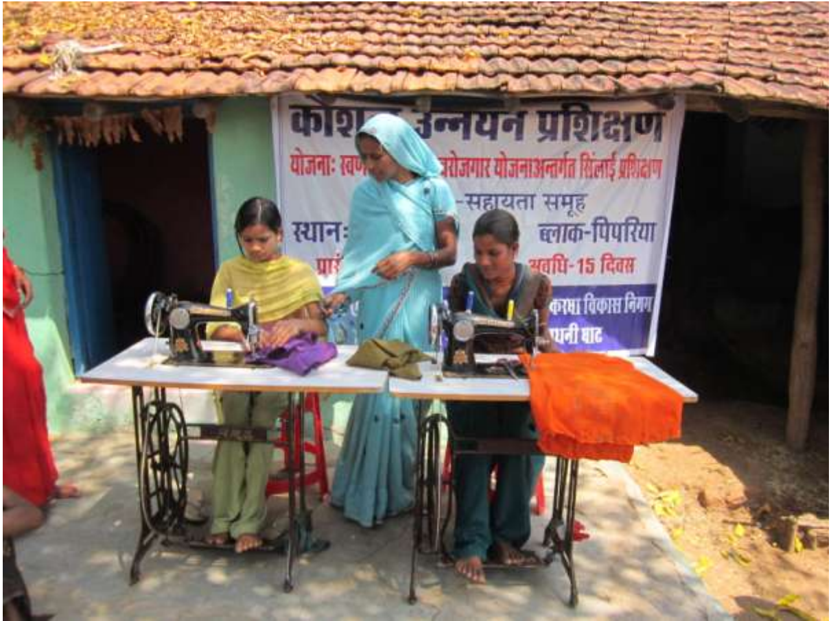
Satpura Tiger Reserve, Raikheda – Village women learn tailoring in programme organised by us