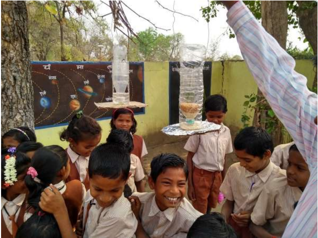
Tadoba, Khutwanda- Students make bird feeders in programme organised by us on World Sparrow Day