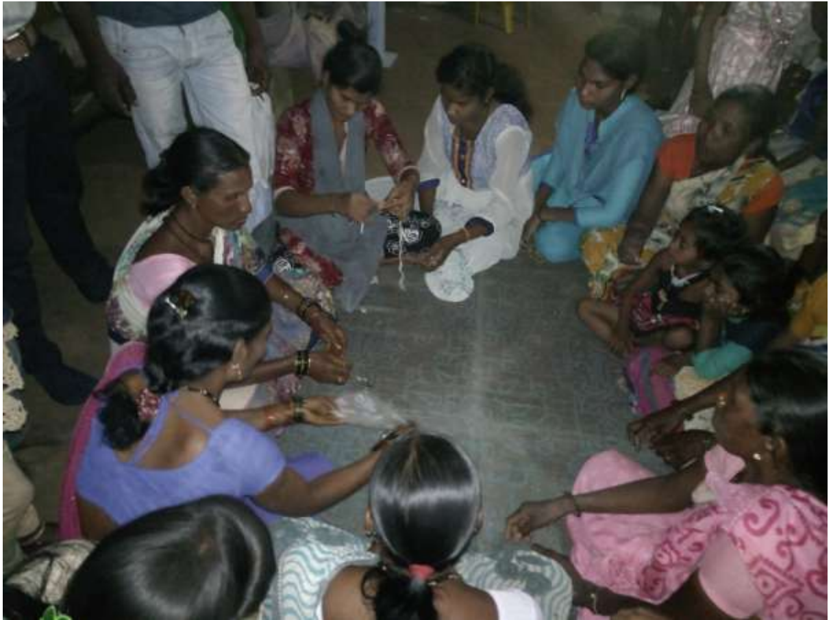
Pench-Bor corridor - Members of Rani Durgawati Bachat Gat, Bidgaon, learn to make scented candles