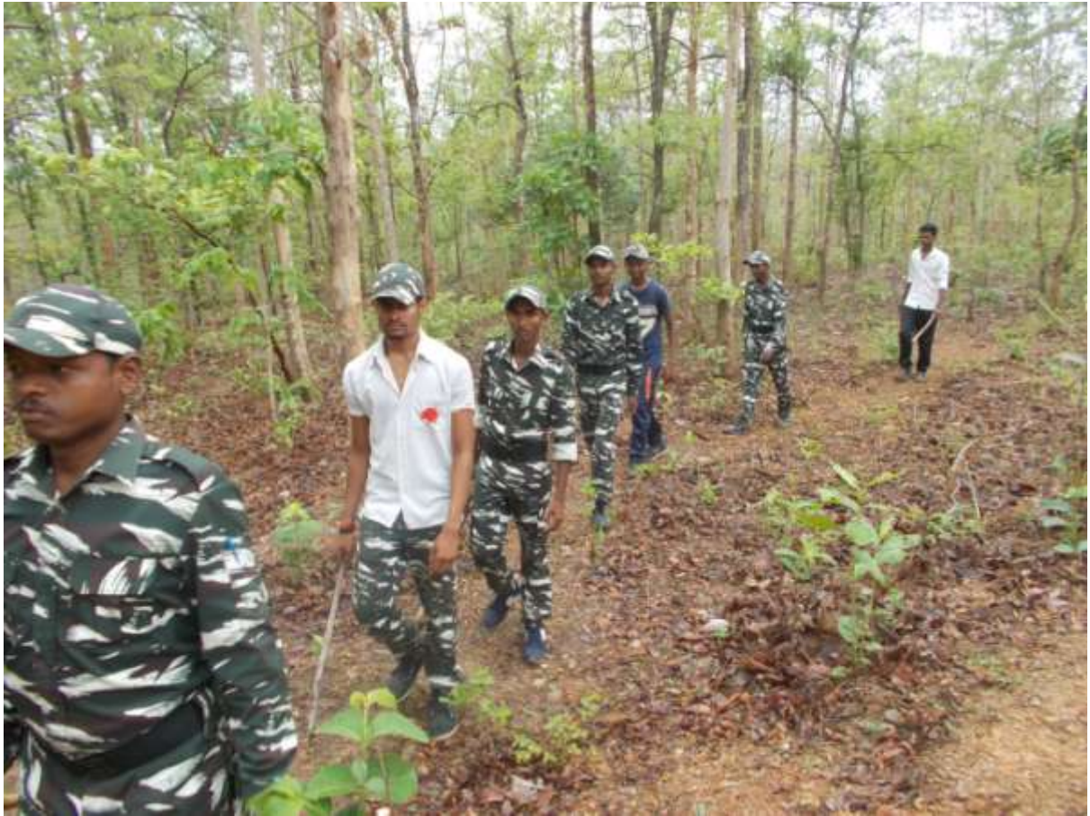
Nagzira – Our volunteers and staff join Forest Department staff in patrol in the jungle