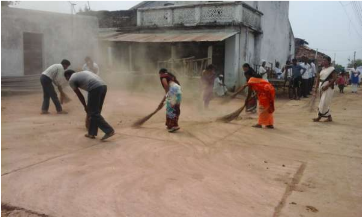
Tadoba, Adegaon – Villagers take part in cleanliness programme organised by our team